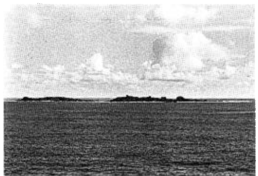
FIGURE 1. Sala y Gomez from the south.

In 1985 ca. 30 were flying over the island. Four chicks, all about to fledge, were found, but shortage of time precluded a thorough search. In 1986 we found no live chicks, only the remains of 13 young of that season, which ranged from half-grown to nearly fledged. On 17 November 1986, J. Reinhard landed briefly and