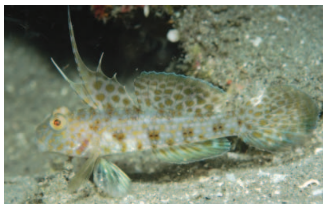
Fig. 3. Underwater photograph of Exyrias akihito , about 50 mm total length, 15 m, off Lawadi Village, Milne Bay Province, Papua New Guinea.

Paratypes – AMS I.20956-028, 100.3 mm SL, Tijou Reef (approximately 13°04'S 143°57'E), Great Barrier Reef, Queensland, 3-12 m, rotenone, AMS party coll., 23 Feb.1979; AMS I.22581-011, 2 ex., 38.4-111.2 mm SL, Escape Reef (approximately 15°49'S 145°50'E), Great Barrier Reef, Queensland, 10-14 m, AMS party coll., 29 Oct.1981; BLIH 19830335, 29.7 mm SL, El Nido, Palawan Island, Philippine Islands, H. Masuda & A. Ono coll., 6-25 Mar.1983; BLIH 19960130, 38.4 mm SL, Amitori Bay, Iriomote Island, Yaeyama Islands, Okinawa Prefecture, Japan, Y. Ikeda & A. Iwata coll., 9 Jul.1996; BLIH 20010003, 34.9 mm SL, same locality as BLIH 1996130, 35 m, K. Yano coll., 18 Jun.2000; BLIH 20010004, 25.2 mm SL, same locality as BLIH 19960130, 26 m, Y. Ikeda, K. Sugiyama & K. Hagiwara coll., 1 Jul.2001; BLIH 20010005, 38.2 mm SL, same locality and as BLIH 19960130, 27 m, Y. Ikeda, K. Sugiyama & K. Hagiwara coll., 1 Jul.2001; BLIH 20010006, 39.0 mm SL, same locality as BLIH 19960130, 27 m, Y. Ikeda, K. Sugiyama & K. Hagiwara coll., 28 Jun.2001; BLIH