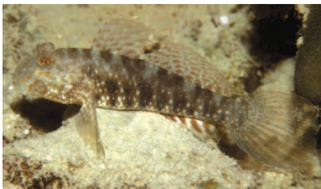
Fig. 6. Underwater photograph of Exyrius bellissimus , about 80 mm total length, 10 m, Milne Bay Province, Papua New Guinea (G. Allen).

P29928-019, 7: 36-77 mm, Cocos-Keeling Islands; WAM P31650-001, 94 mm, Cassini Island, Kimberleys, Western Australia; WAM P30309-010, 69 mm, Cassini Island; WAM P27662-030, 74 mm, Clerke Reef, Rowley Shoals, Western Australia; WAM P29054-003, 77 mm, West Island, Ashmore Reef, Timor Sea; WAM P30412-007, 2: 44-49 mm, Bohaydulong Island, Bodgaya Islands, Sabah; WAM P31546-004, 30 mm, Gam Island, Raja Ampat Islands, Irian Jaya.