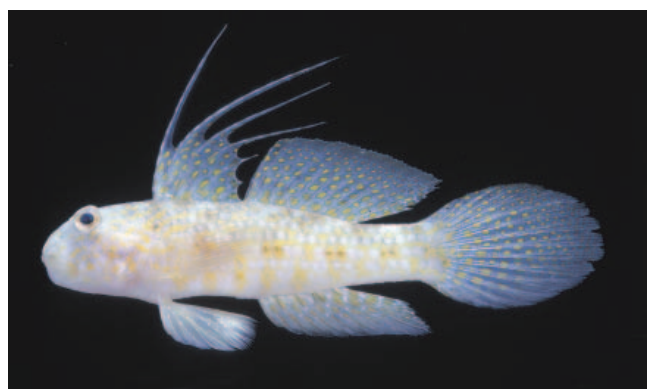
Fig. 1. Holotype of Exyrias akihito , male, NSMT-P 71648, 67.1 mm SL, 28 m, Amitori Bay, Iriomote Island, Yaeyama Islands, Okinawa Prefecture, Japan (Y. Ikeda).

Exyrias sp. – Allen & Adrim, 2003: 58 (Bali and Manado, Sulawesi).