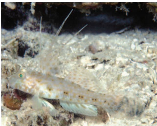
Fig. 5. Underwater photograph of Exyrius akihito , about 70 mm total length, Palau, 15 m.

Comparative material. – Exyrius bellissimus : BPBM 29677, 4: 43-55 mm, Pulau Pari, Seribu Islands, Java, Indonesia; BPBM 15767, 87 mm, Madang, Papua New Guinea; BPBM 32567, 3: 36-77 mm, Nagada Harbour, Papua New Guinea; BPBM 1283, 116 mm, Shortland Island, Solomon Islands; BPBM 15696, 2: 50-51 mm, Yacht Harbor, Guadalcanal, Solomon Islands; BPBM 21855, 2: 57-73 mm, Salu Islet, Singapore, 2: 57-73 mm; BPBM 29386, 85 mm, Low Isles off Port Douglas, Queensland; BPBM 9740, 2: 62.5-69 mm, Uru Island, Palau; BPBM 9754, 3: 19-58 mm, Uru Island, Palau; BPBM 31405, 2: 66.5-74.5 mm, Auluptagel, Palau; BPBM 9956, 3: 54-82 mm, Phonpei, Caroline Islands; BPBM 29384, 25 mm, Phonpei, Caroline Islands, W side of Phonpei Passage; WAM