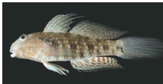
Fig. 7. Exyrius bellissimus , 77 mm SL, Pohnpei, Caroline Islands (J. Randall).

Body moderately elongate and laterally compressed, more strongly compressed posteriorly; body depth at pelvic-fin base 4.05 (3.67-4.15) in SL; body depth at anal-fin origin 4.17 (3.68-4.82) in SL. Head laterally compressed, its width slightly less than its depth at level of preopercular margin. Head length 3.37 (3.24-3.44) in SL. Snout length 2.47 (2.17-3.31), eye diameter 3.75 (3.38-4.23), and interorbital width 20.74 (15.69-30.94), all in head length. Distance between