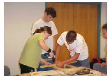
“Engineering Technology,” a week-long introduction to contemporary engineering technology for grades 7 – 12