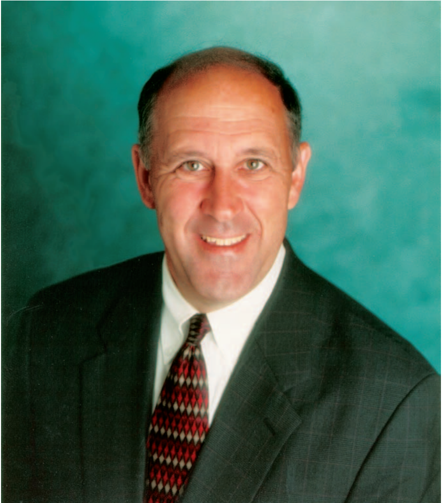
Governor JIM DOYLE