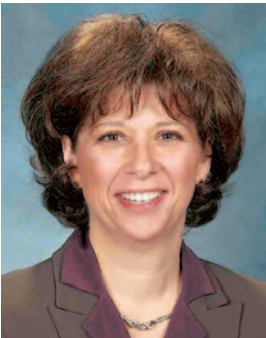
Attorney General LAUTENSCHLAGER