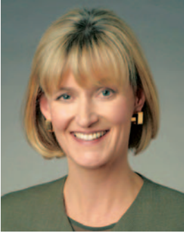
Lieutenant Governor LAWTON