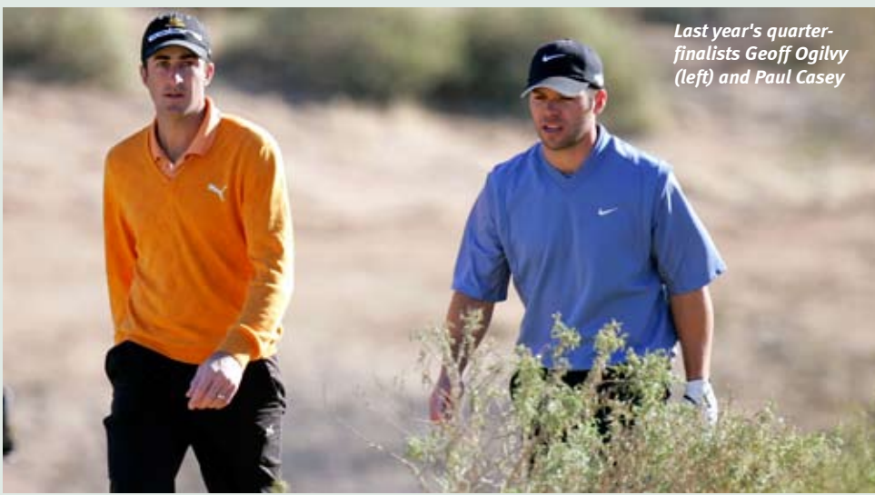
Last year's quarter-finalists Geoff Ogilvy (left) and Paul Casey

Two-time US Open Champion Retief Goosen of South Africa opens against the big-hitting Argentinian Andres Romero in the top half of the draw while two of Europe's Ryder Cup stalwarts at The K Club, Paul Casey of England and Sweden's Robert Karlsson, are in direct opposition, as are Denmark's Søren Hansen and England's Ian Poulter.