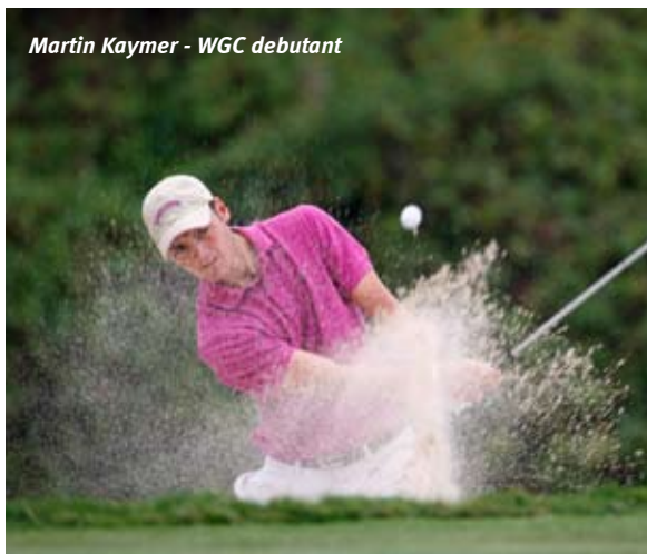
Martin Kaymer - WGC debutant