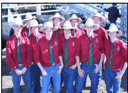
The Farrer stock handlers presented A professional look to complement the catalogue of Angus bulls