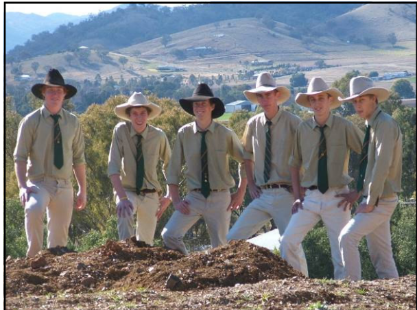
HSC Primary Industries Students excited to be going to the AA Company properties in the Territory for work placement