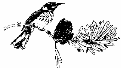
New Holland Honeyeater

Keep a look out for the variety of wildlife living in the Koomba Park billabongs and dams. The wetlands are interspersed with bushland areas, making it a wonderful area to bird and frog watch. Sit back for a while and test your knowledge by identifying birds or recognising frog calls. Watch the wildlife from the bird hide the Friends group constructed on the lake.