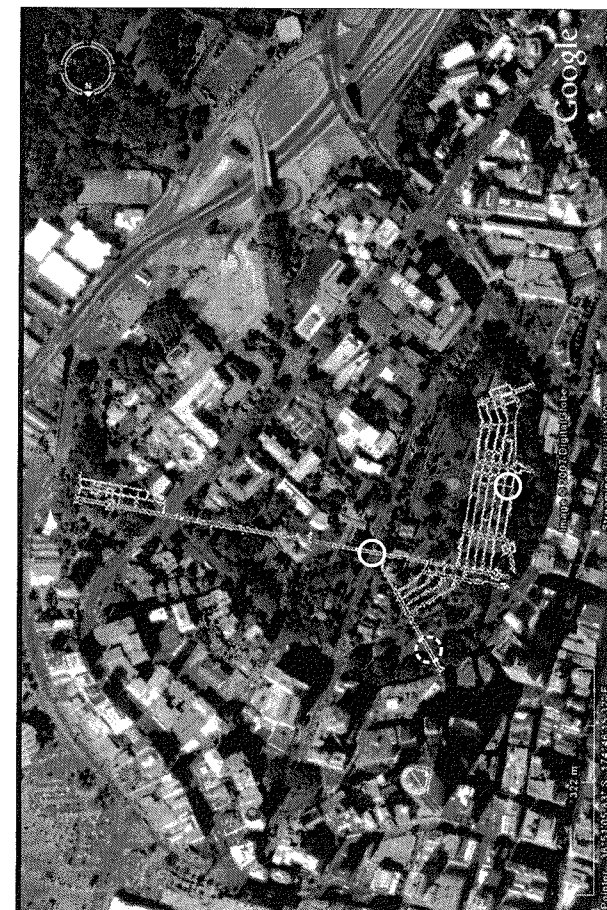
Figure 2. Composite image of tunnel systems, circles indicating known collapses, dashed circle indicating suspected collapse. Cityscape taken from Google Earth, tunnel layout taken from engineers blueprints (sourced from Auckland City Archives).

servation of the tunnels would need to be carried out during and following an investigation as an exploration would not be permitted to occur without the intervention of structural engineers, which is one of the reasons why to date nothing has occurred, as there appears to be no-one willing to finance a team of engineers – particularly on a project which could fail (Bennett 2007; Crossley 2007; Farrant 2007; Tonks 2007).