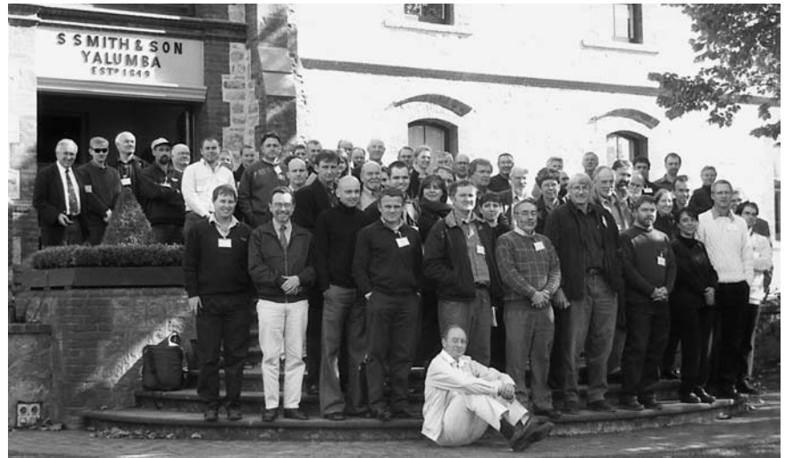
Delegates at the seminar

modern methods of lime production. Below is a transcript from one of the speakers.