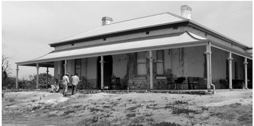
Cantara Homestead, Coorong National Park

A number of lighthouses (including cottages, supply routes and cemetery);