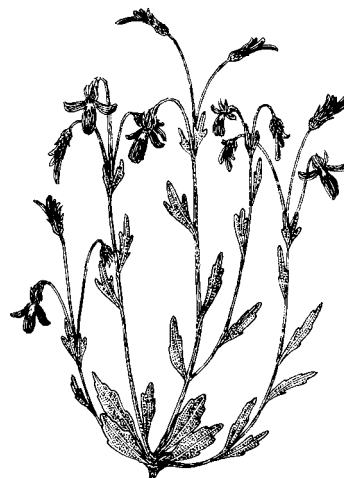
Lobelia rhombifolia.

Reserved in the Cameron Regional Reserve, Freycinet National Park, Moulting Lagoon Game Reserve and the Snug Tiers Nature Recreation Area.