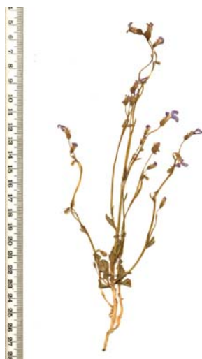
Lobelia rhombifolia . Tasmanian Herbarium specimen.