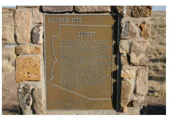
Entrance to Sunset Cemetery

1300 W. Washington Street Phoenix, AZ 85007-2929 Tel & TTY (602) 542-4174 (800) 285-3703 www.azstateparks.com