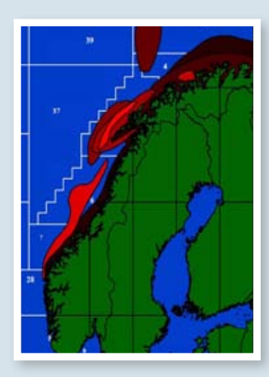
Decision aid tool. Operators will have access to information advising of any considerations that must be taken into account. The map shows the distribution of fish.

In order to ensure that information reaches operations planners, FFI is collaborating with the Institute of Marine Research to develop a decision aid tool to assist in the planning and execution of sonar exercises. This tool will be placed on board the new Nansen class frigates and integrates information about fishery activity and the presence of different species in time and space with information about the sensitivity of individual species to acoustic signals and the applicable operational regulations. With the decision aid tool, the Armed Forces can easily obtain an overview of the particular considerations that must be taken into account within a certain ocean area in any given period of time.