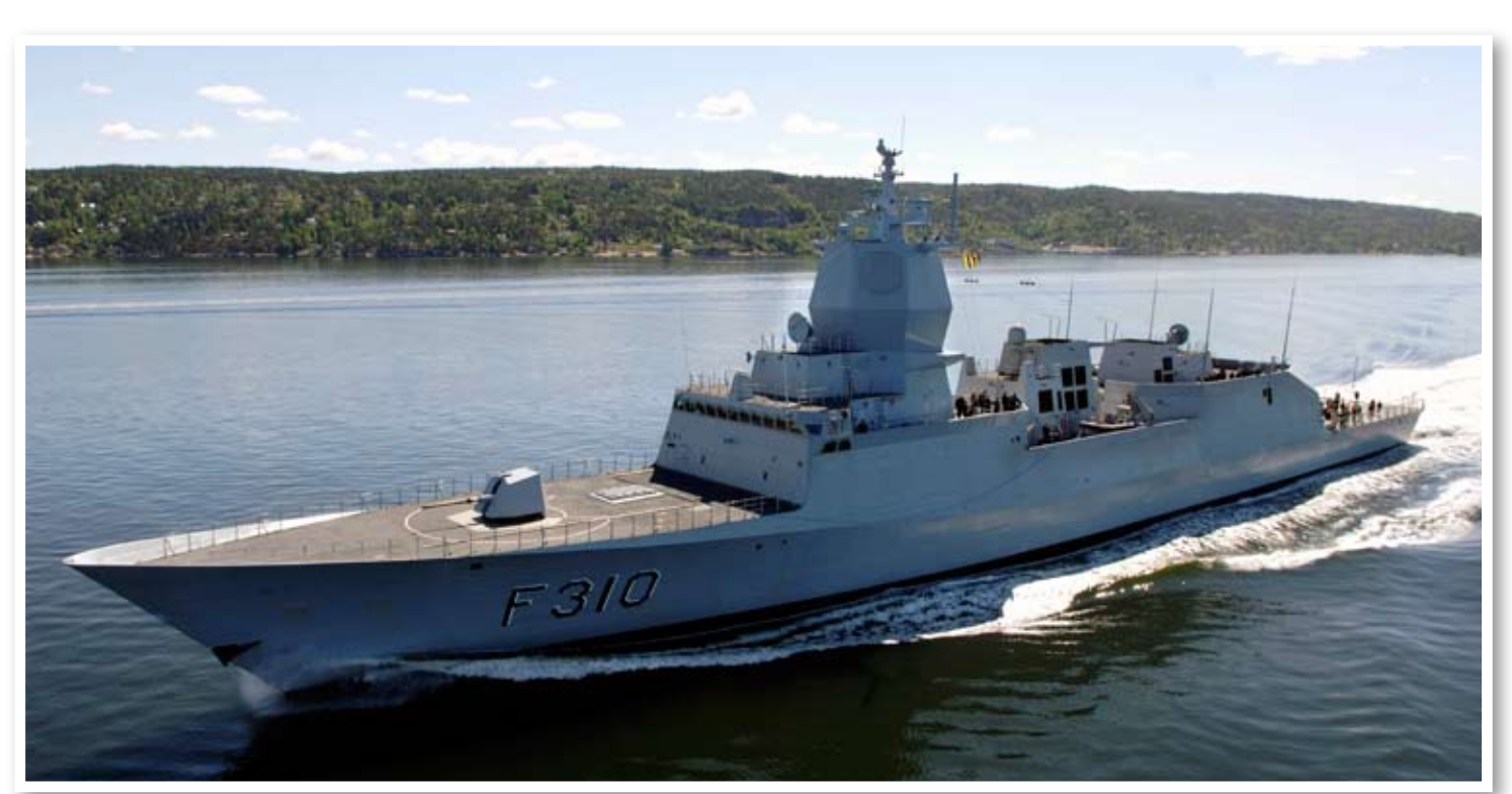
Flexible. The Nansen class frigates are the backbone of Norway's future naval defense. The frigates will have the capability of combating submarines, surface vessels and air targets. Each of the frigates will have a NH-90 helicopter on board.

Erik.Sevaldsen@ffi.no Petter-Helgevold.Kvadsheim@ffi.no