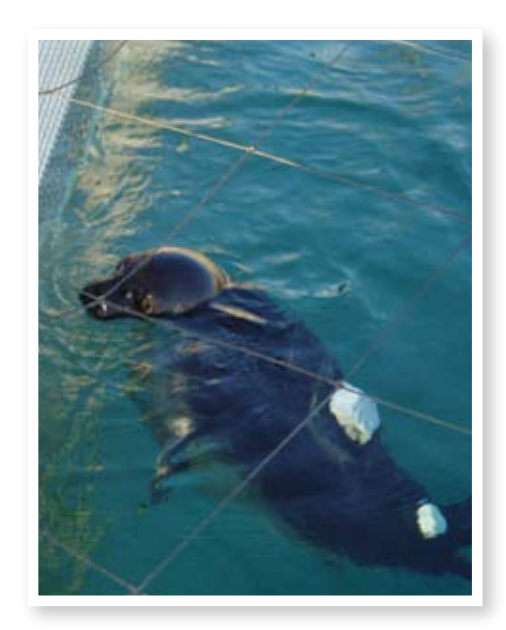
Seals. The Department for Arctic Biology (University of Tromsø), National Hospital of Norway (Rikshospitalet) and FFI have been studying how seals react to sonar signals.

Our aim is to minimize the risk of harm to individual animals. As long as they are not in the immediate vicinity of the sonar source (closer than 100 m), it appears that marine mammals are not directly harmed by sonar. However, possible causal links between development of decompression sickness (the bends), a phenomenon that appears to occur in certain species, and the use of active sonar is still obscure. Further more, there are no studies that have looked at potential injury (e.g. hearing injury) to marine mammals that range very close to a sonar source. Of the species of seals and whales that have been studied, it appears that