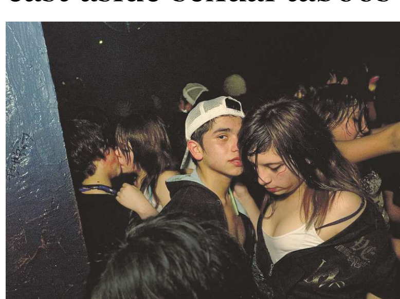
Dancers at an afternoon party in Santiago. The youth-led sexual revolution is happening in a once conservative country that only legalized divorce in 2004.