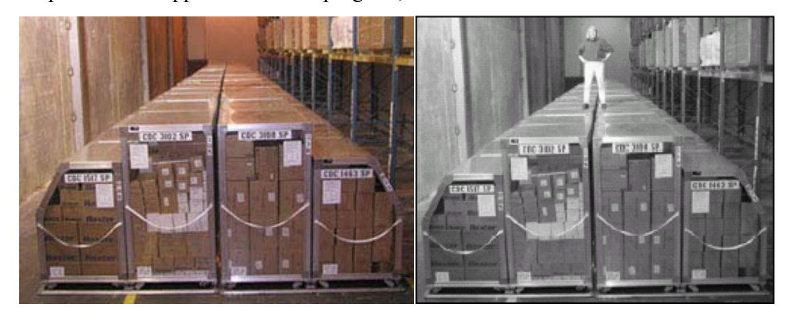
Figure 1 – A single "push package" weighs 94,424 pounds and fills either one wide-body aircraft or seven tractor trailers. The Strategic National Stockpile program pledges to deliver the pre-packaged supplies within 12 hours of the Federal (DHS) decision to deploy.

Thompson's order to deploy. Three of the four airplanes in American airspace the night of September 11 supported the SNS program; the fourth was Air Force One.