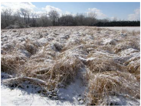
'Shelter' switchgrass provides cover in the snow

• Recommendations for enhancing ecological diversity, stabilizing streambanks, revegetating wetlands, implementing odor control, establishing buffers, and improving range and pastureland quality.