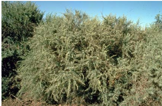
Fourwing saltbush is used for restoration in the southwest, providing food and habitat for wildlife and livestock.