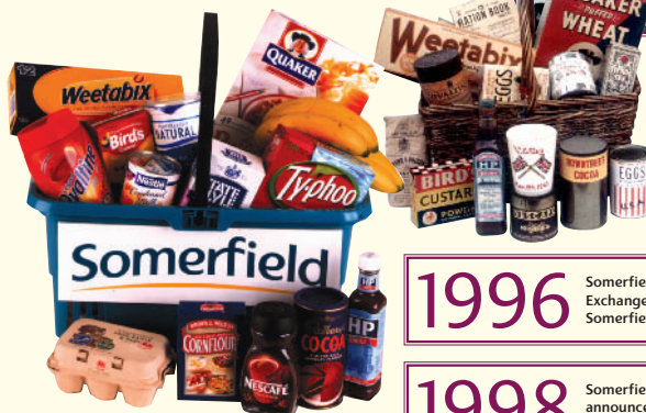
WAR TIME & PRESENT DAY GROCERY BASKET