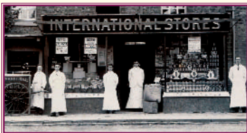
EARLY HOME DELIVERY Early 1900s delivery boy with handcart

Note the frayed aprons of the all male staff. The manager is wearing the short jacket. The window display from left to right: packs of loose tea, dried fruits, cheeses, bacon. No refrigeration was available.