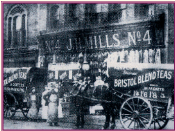
Delivery vans advertising Bristol tea and coffee wait outside a JH Mills Store.