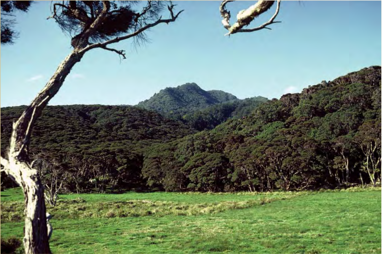
Te Maraeroa Flat, with the summit in the background, 1977, Dick Veitch