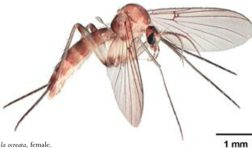
Fig. 5. Sciophila ocreata , female.

basal antennal flagellomere pale brown, with subsequent segments becoming darker, and the thorax is variegated with pale brown (Fig. 5). The wing venation is similar to the previous species. The males are easily distinguished from those of S. parviareolata by the deep U-shaped emargination of the ninth tergite. PJC is preparing a separate publication in which S. ocreata and the related South American species will be redescribed.