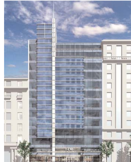
LULAC's Future National Headquarters Projected completion: December 2006

Contributions to the LULAC Building Fund Campaign can be spread out up to five years beginning in 2006 or 2007 to ease the impact on your philanthropy budget while receiving full recognition benefits this year.