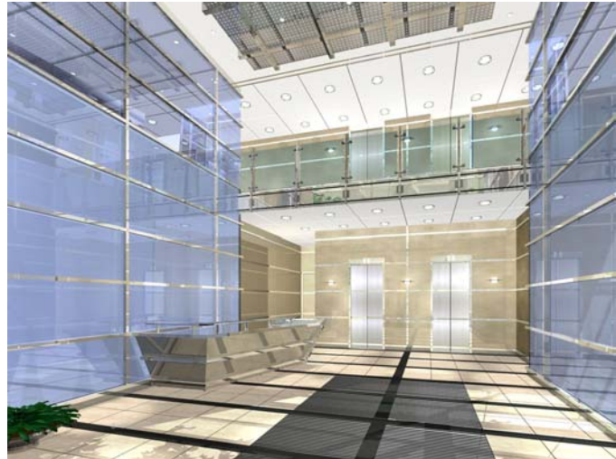
Lobby of the LULAC National Headquarters Building

Become part of LULAC history! Contribute now to help LULAC acquire its permanent national headquarters in Washington, DC.