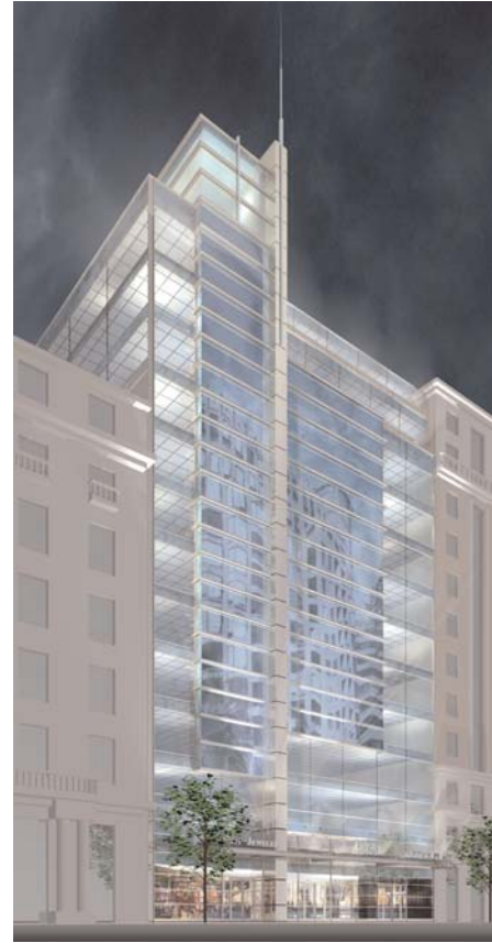
LULAC's Future National Headquarters at 1430 K Street, NW, Washington, DC.

Contributions to the LULAC National Building Fund are tax deductible contributions to a 501(c)3 nonprofit organization.