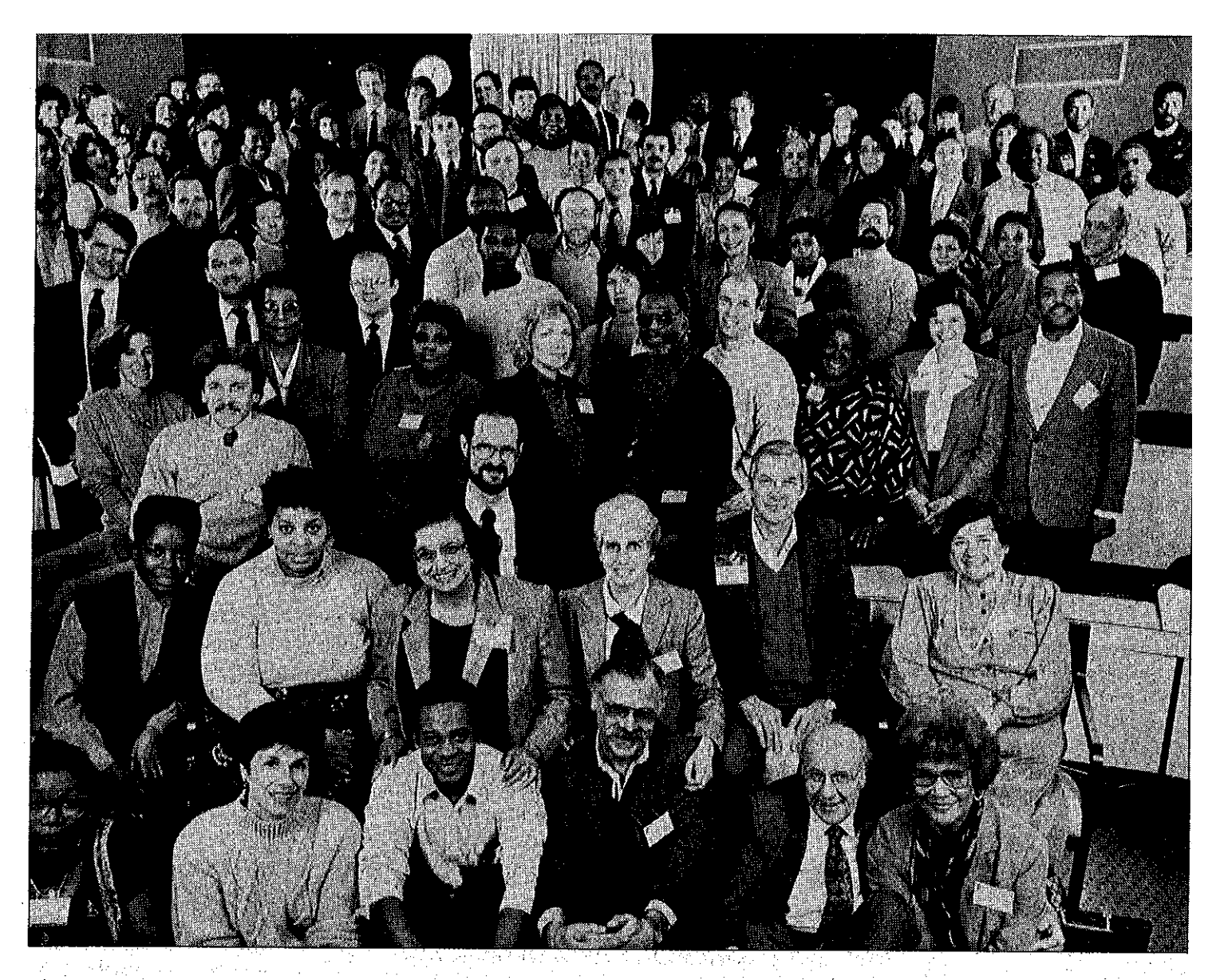
Members of the Citywide Coalition for School Reform at the group's annual retreat, January 1990.