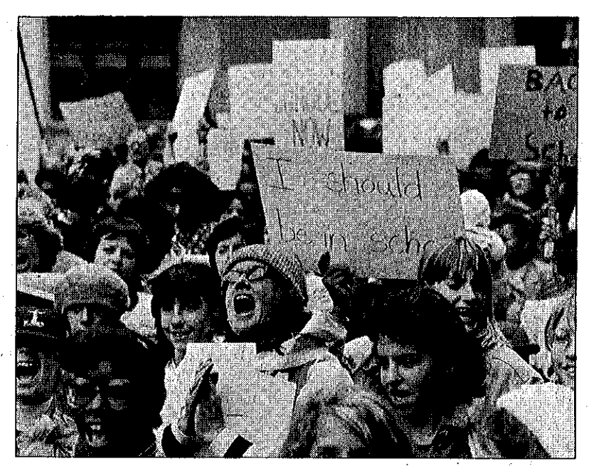
Parents and students join in protest of the 1987 Chicago teachers strike. Demonstrators brought their message to the State of Illinois Center, then City Hall.

But the strike didn't get settled; even after the massive protests