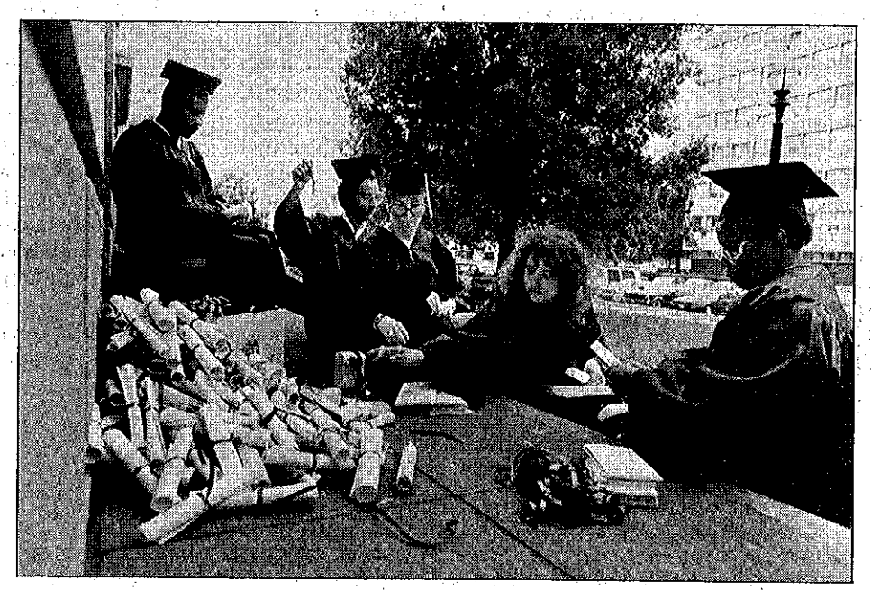
While legislators and reformers were drafting the legislation inside, outside demonstrators were holding a mock graduation ceremony for students who had dropped out of Chicago's schools.

Some Democrats also criticized the bill; Sen. Ted Lechowicz called the provision for training of school councils just another grab for jobs and contracts, and others wondered again why there were no provisions for early childhood, reduced class size, and other "educational" provisions. But in the end, in both houses, the voting followed party lines. This time the Senate