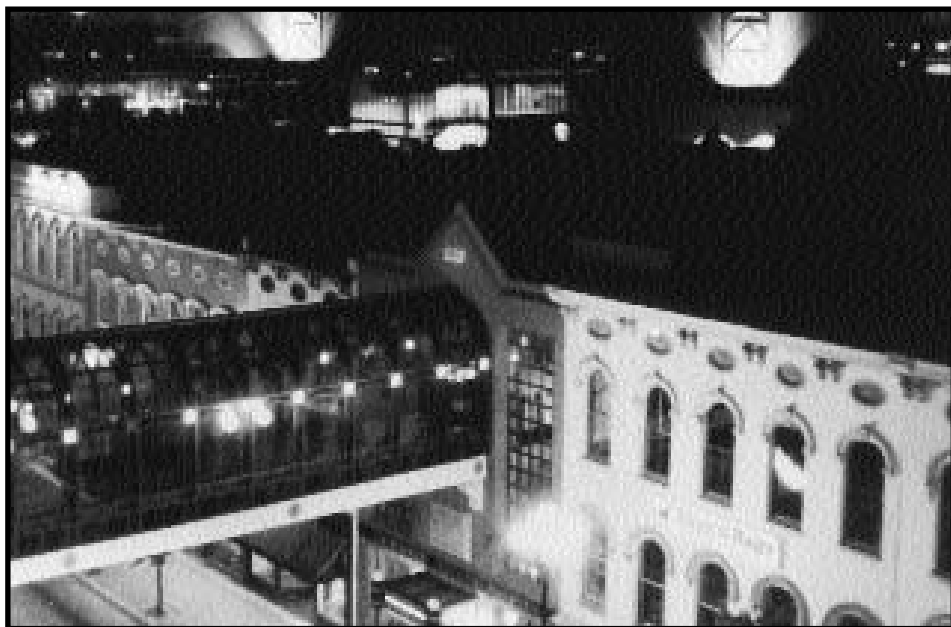
Downtown Lexington at night.

The city of Lexington is surrounded by beautiful countryside and horse farms.