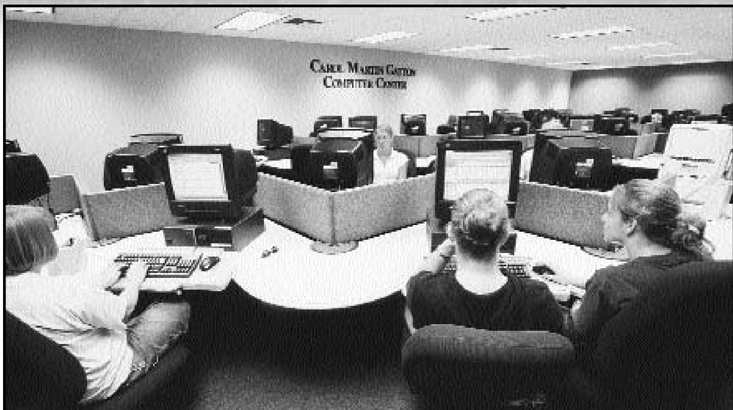
The Carol Martin Gatton Computer Center at CATS houses 35 computer terminals.