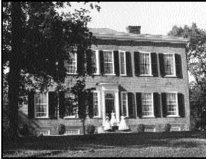
“My Old Kentucky Home” in Bardstown is a Kentucky landmark.

Kentucky also is a land steeped in the rich history of our nation. Legendary pioneer Daniel Boone laid out Kentucky's second settlement at Fort Boonesborough and nearby, a hundred years