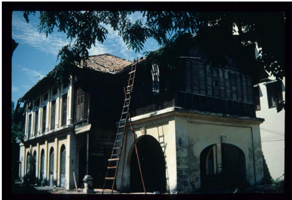
Old Brethren Mission House