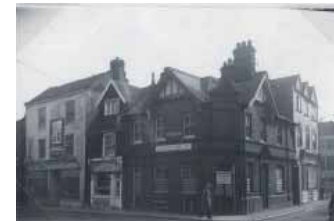
58 - 62 Botolph Street