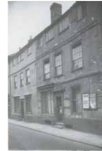
38 Pitt Street

Where it crosses Magdalen Street, the flyover provides a useful shelter for bus passengers and small market stalls. Otherwise this area is unused and unattractive (n).