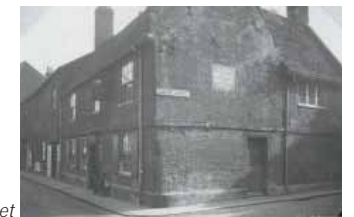
38 Botolph Street