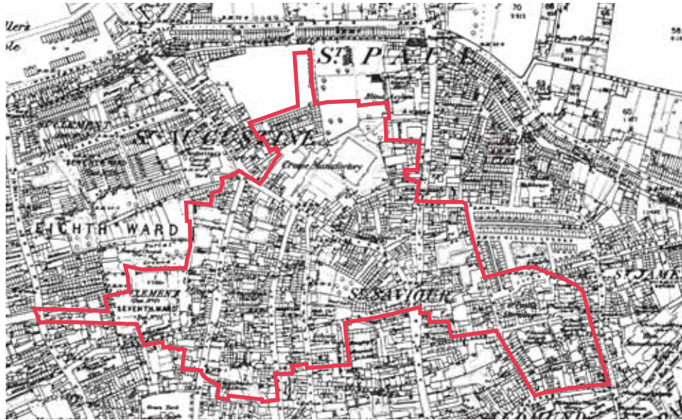
Extract from 1886 OS map

was situated at this junction (and gave it its name) was demolished in the late C15.