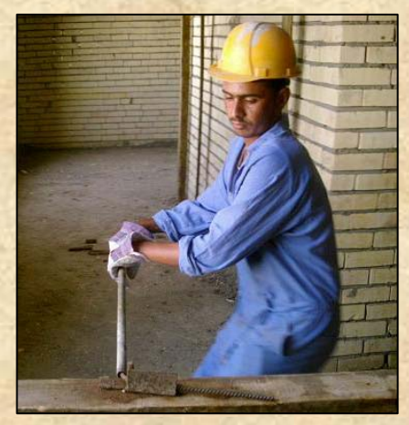
An Iraqi construction worker wears and uses his personal safety equipment on the job.

"There are many things that I have taught, but the most important one was teaching three Iraqi engineers who work for me in the safety