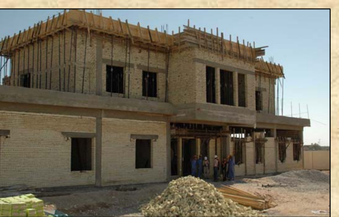
The primary healthcare clinic in Qal at Sukkar, here in a Sept. 28 progress photo, will provide area residents with medical and dental services.

He also mentioned that humanitarian organizations like Red Crescent and Red Cross are usually more oriented towards the PHC providing vaccinations, educational and sanitation