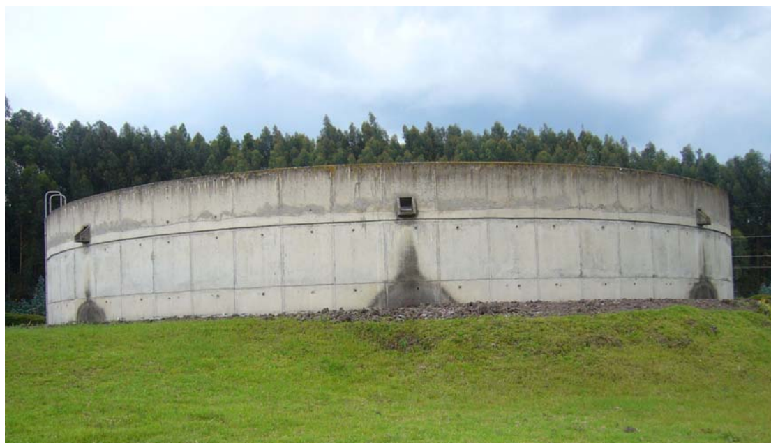
Storage tank of 1,500 m3 at Mutobo intake works