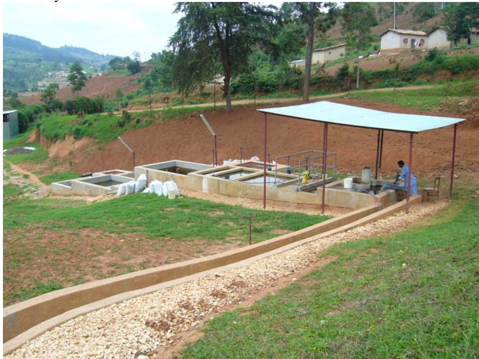
Water treatment works for Nyanza

It could be observed that increasing the capacity of the system would be relatively straightforward. There is room for expansion of the raw water treatment, and water is sufficiently available from the river intake.