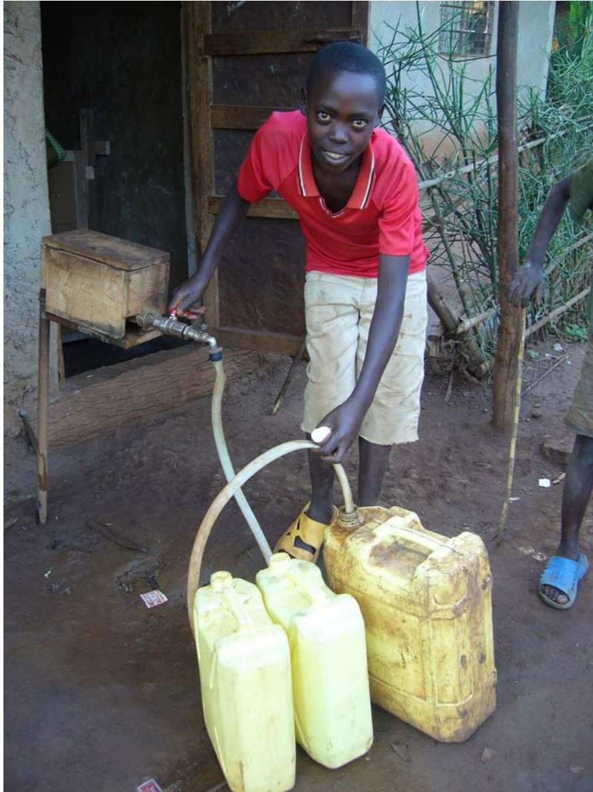
Communal water point in Rwamagana