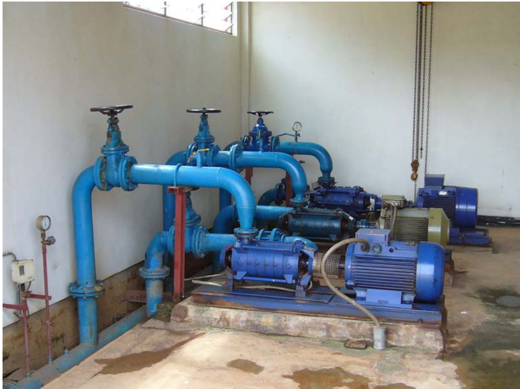
Rwamagana intake works – well maintained pump station

At the treatment works there is a small but adequate laboratory for testing basic water quality parameters, Hardness (calcium, magnesium), Residual Chlorine and Turbidity. Bacteriological tests are carried out in Kigali on samples taken every month.