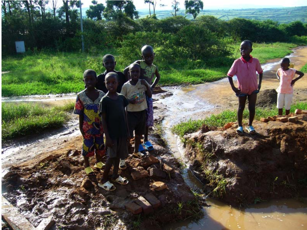
Kids enjoying a burst pipe in Nyagatare