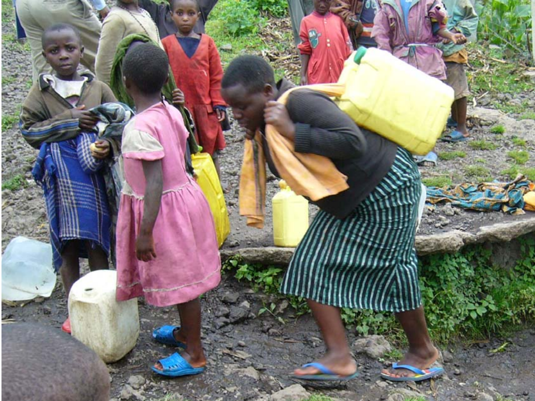
Children collecting water from the Mutobe Springi.

There is no organised form of solid waste collection in Musanza.