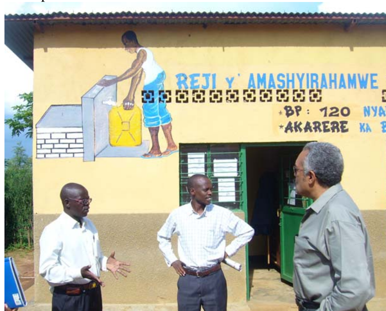
Discussion with the Mayor in Nyamata – Bugesera

There is no organised form of solid waste collection in Nyamata, but it does not seem to create a serious problem.