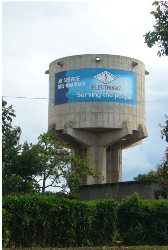
Water Storage Reservoir - Rwamagana