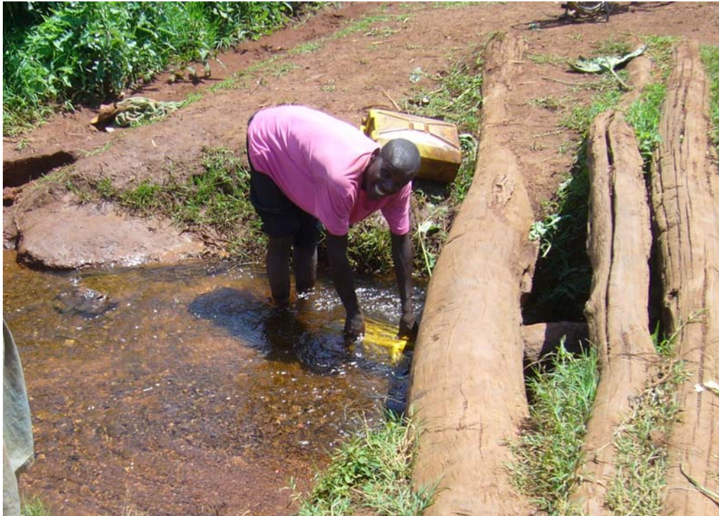
No piped water in Kayonza

All stakeholders agree it will be beneficial to have a rainwater harvesting promotion programme in the town. Many of the public institutions do not have such facilities.