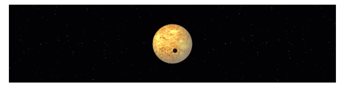
Fig. 1. Animation of a typical Pegasid system, with both the star and planet drawn to scale. Here, the planet orbits the star in just 3.5 days. For comparison, the Earth orbits the Sun every single year, and Mercury, which has the shortest orbital period in the solar system, orbits the Sun every 88 days. The movie file is available in the <u>electronic edition</u> of the press release.

Up to now, astronomers have discovered 188 extrasolar planets, among which 10 are known as "transiting planets". These planets pass between their star and us at each orbit (Figure 1). Given the current technical limitations, the only transiting planets that can be detected are giant planets orbiting close to their parent star known as "hot Jupiters" or Pegasids. The ten transiting planets known thus far have masses between 110 and 430 Earth masses (for comparison, Jupiter, with 318 Earth masses, is the most massive planet in our Solar System).