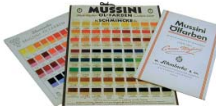
Colour charts from the 1930s

Finest pigments, extra-ordinary brilliance, highest possible light resistance, colours of superior quality – that's MUSSINI® . All 102 shades of this unique natural resin oil colours do meet the artists' highest requirements as we do use only finest artists' pigments in highest concentration and pureness.