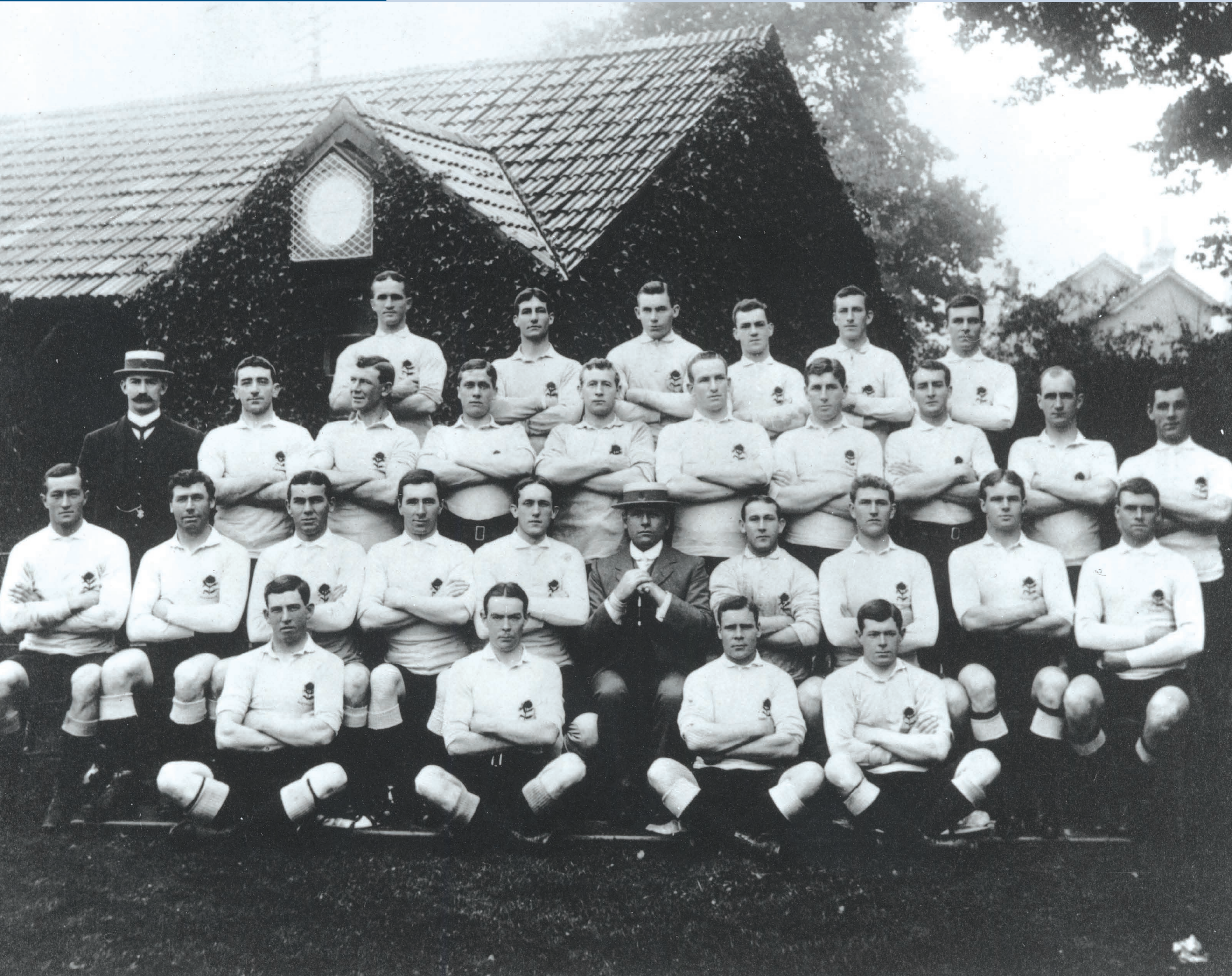
■ The Wallabies team against Wales, 12 December, 1908