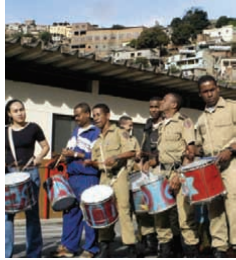
Ford grantee AfroReggae, a hip-hop group formed to ease tensions between young people and the police, trains officers in drumming. Left: A Xingu Indian votes at a school in Sao Felix do Xingu in the state of Para.

Democracy is strongest when citizens are fully engaged in the issues facing their communities. We make grants to strengthen participation in democracy and reduce social injustice and inequality. We focus our grant making in three areas: