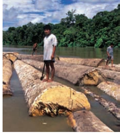
Loggers harvest sandalwood trees, part of a sustainable resource program in the state of Amazonas. Left: Fishermen work their nets in a small fishing village outside Salvador da Bahia; In the Deforestation Belt, a rain forest burns.

Brazil's Amazon River basin is a region of extreme poverty, inequality, agrarian conflict and environmental degradation. Our work there supports initiatives to eradicate poverty and preserve the environment in the most critical area of this region—the Deforestation Belt, where rapid urbanization and timber cutting are rampant.