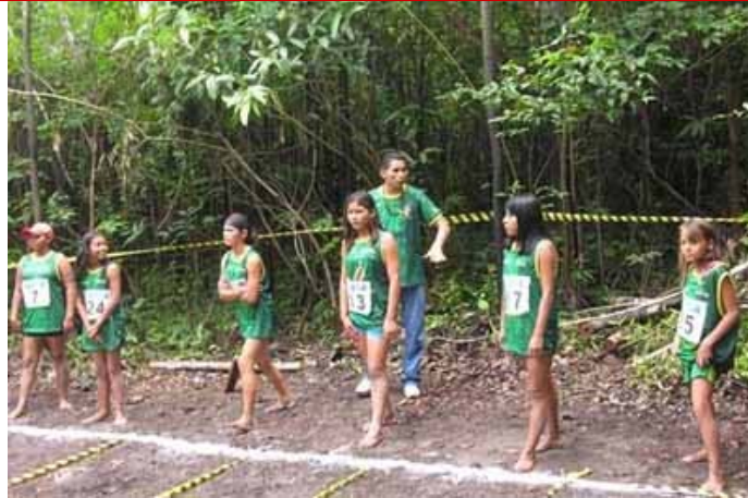
Start of women's 50m in the Amazonian jungle