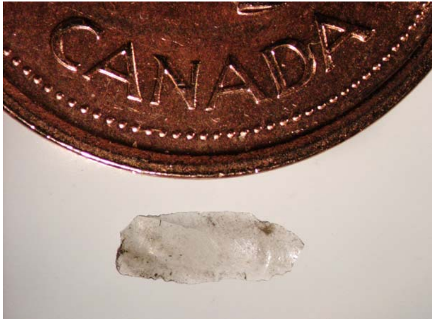
Figure 1: EISx-10 Microblade with a Penny for Scale.

The artifact was found during the microscopic analysis of matrix samples from the site of EISx-10, a coastal shell midden located in the traditional territory of the Heiltsuk First Nation on the central coast of British Columbia. The site is one of several shell midden sites on Fougner Bay, on the mainland just north of Namu. It, along with fifteen other sites in the area, was the subject of core and auger sampling I undertook in 1996 and 1997. Small diameter cores provided intact sections of deposits for radiocarbon dating, while larger matrix samples obtained with a larger diameter bucket-auger were used for the recovery and analysis of fish and shellfish remains. The results of site dating and faunal analysis are described elsewhere (Cannon 2000a, 2000b). The matrix recovered in the auger samples was sufficient to give a good indication of the variety and intensity of marine fishing and shellfish gathering.