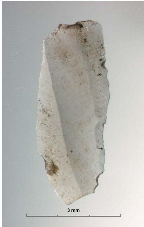
Figure 3: Dorsal Surface Showing Twin Arrises.

on this part of the coast. Microblades are found in deposits dating from 9000 to 5000 cal. BP at the nearby Namu site (Carlson 1996). What sets this particular example apart is not its presence in this location at this time, or its manufacture from obsidian, the material of choice for microblades at Namu (Hutchings 1996:170), or even the means by which the artifact was recovered and dated. What sets this particular example apart from the majority of microblades recovered from sites on the BC coast, and those found in most other parts of the world, is its very small size.