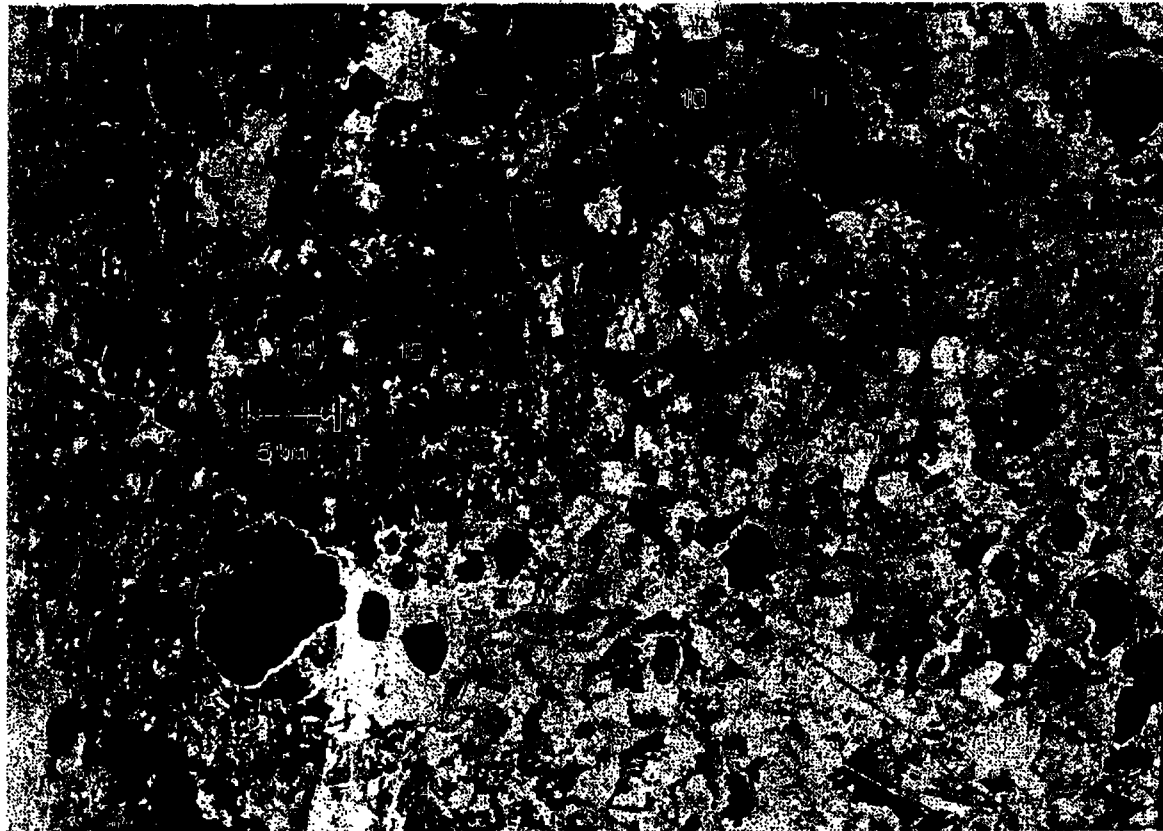
Figure 3 Reservoirs and lakes at Chelyabinsk-65. 1. Lake Irtyash (Reservoir number 1); 2. Lake Kyzyltash (Reservoir number 2); 3. Reservoir number 3; 4. Reservoir number 4; 5. South Urals Project (Construction of 3 BN-800 reactors); 6. Lake number 6; 7. Chelyabinsk-65 reactor area; 8. Ozersk (Chelyabinsk-65 residential area); 9. Lake Karachey; 10. Reservoir number 10; 11. Reservoir number 11; 12. Techa River; 13. Kyshtym; 14. Lake Bol'shaya Akulva; 15. Lake Akakul'; 16. Lake Ulagach; 17. Lake Staroe Boloto (Old Swamp).