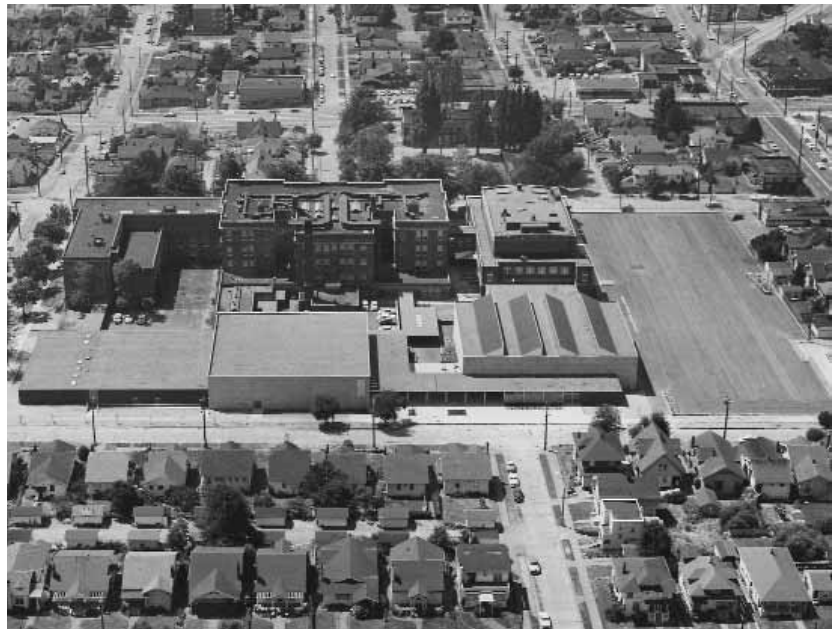
Lincoln, 1960