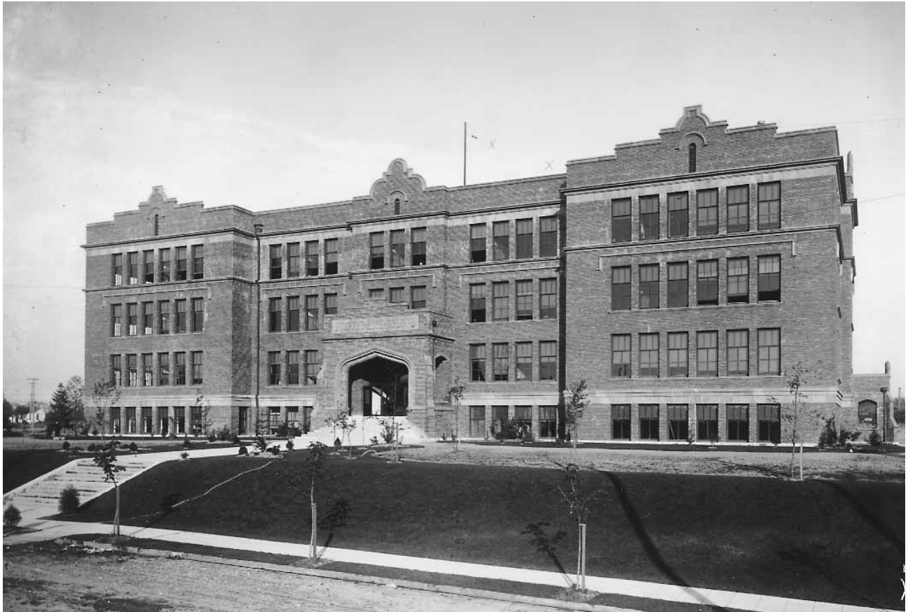
Lincoln, 1911

Name: Lincoln Address: 4400 Interlake Avenue N Current Use: Interim site