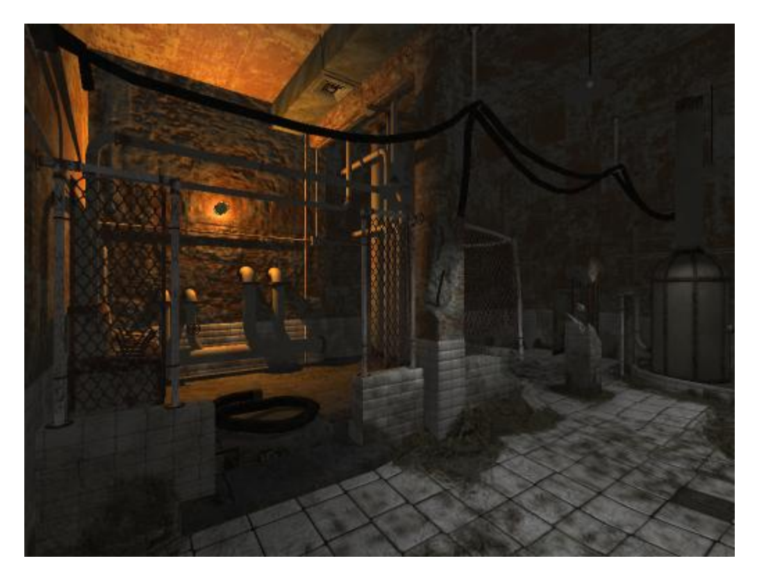
Figure 1.9 Final image