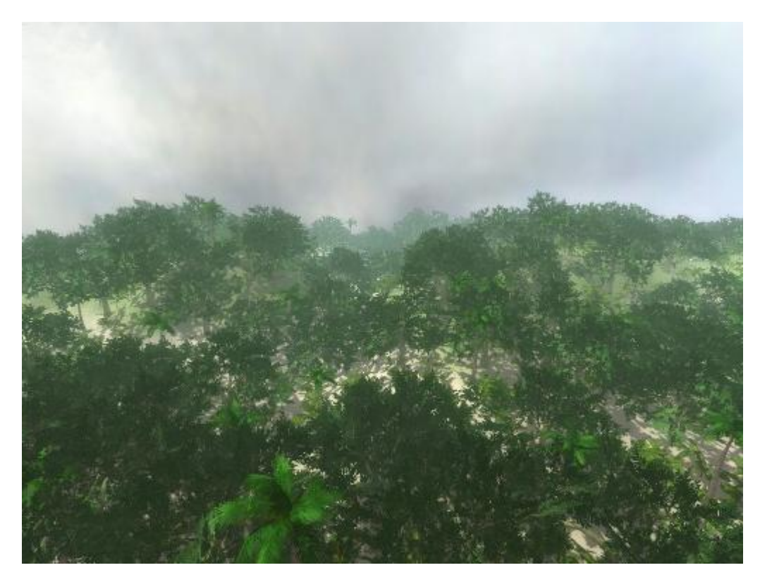
Figure 1.0 Deferred lighting performance is independent from scene complexity.

Whereas a forward renderer will usually draw to a color and depth buffer, deferred shading uses an additional screen space normal buffer. The combination of normal and depth data is sufficient to calculate lighting in a post-processing step, which is then combined with the color buffer.