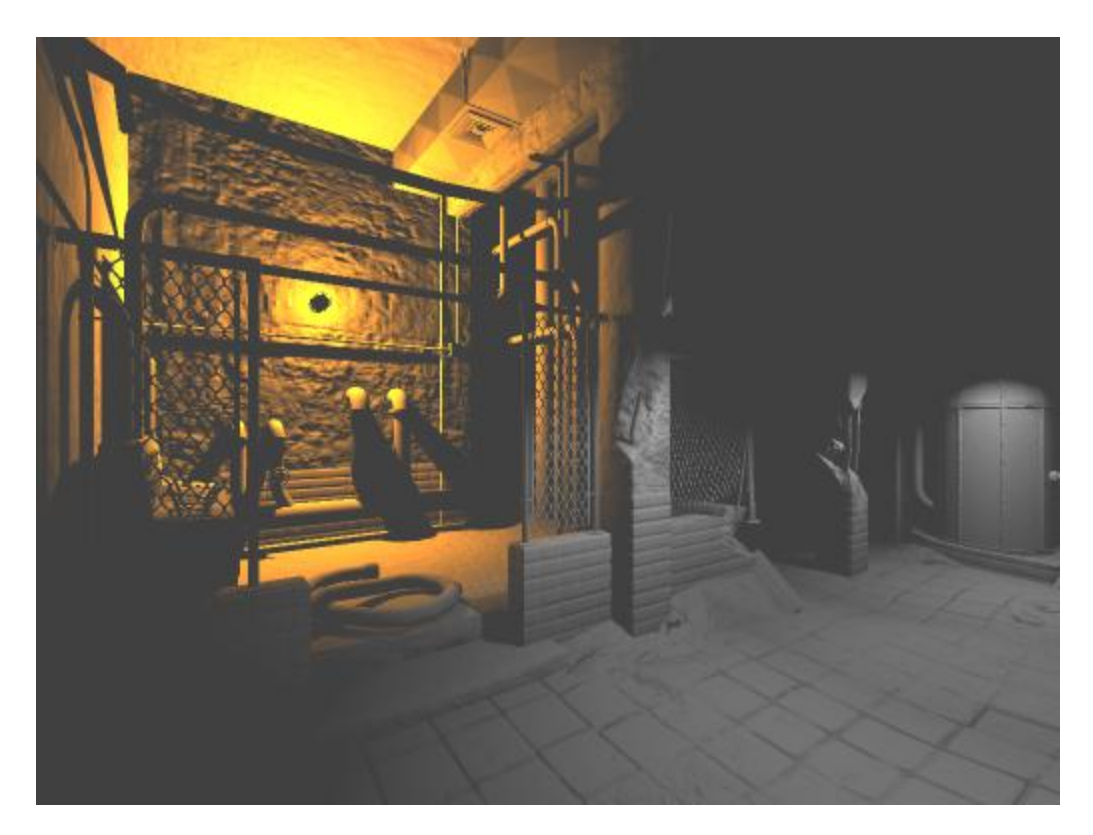
Figure 1.7 Diffuse lighting