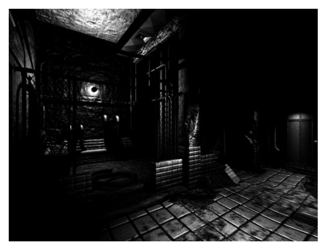
Figure 1.8 Specular reflection