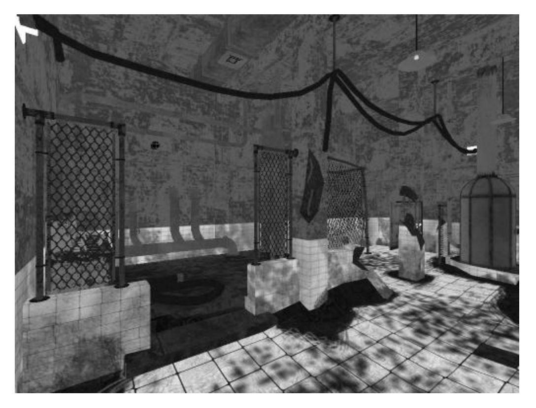
Figure 1.6 Specular factor