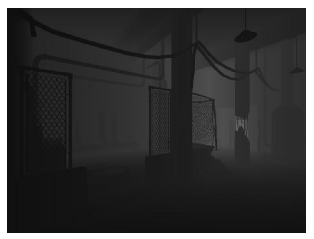
Figure 1.4 Depth