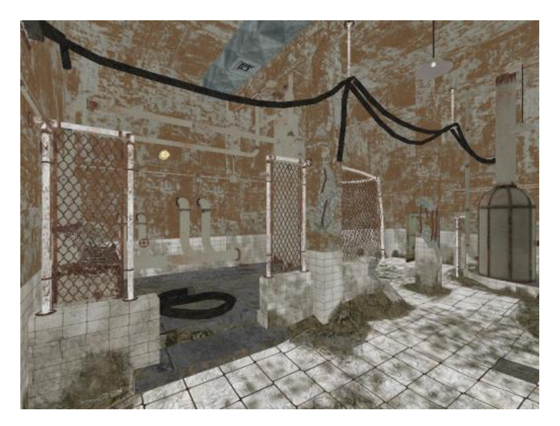
Figure 1.3 Albedo