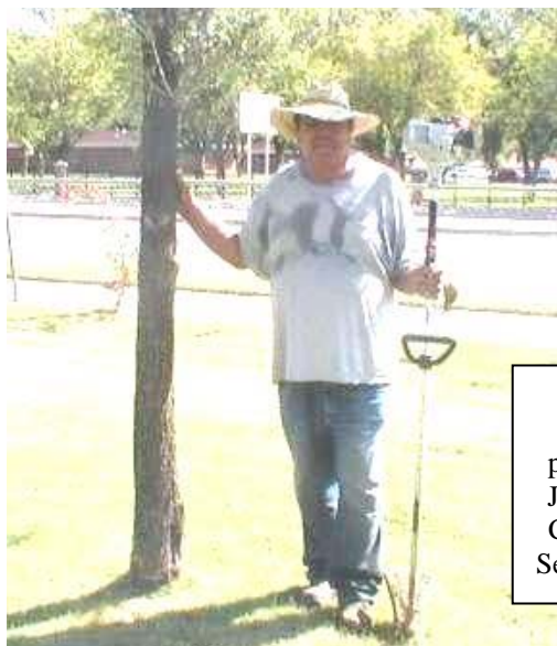
Big Joe

Volunteers are needed for the Retired and Senior Volunteer Program (RSVP) and Senior Companion Program (SCP). Are you 55 years old, or older? Our RSVP has over 100 worksites requesting volunteers. SCP is for seniors 60 years or older, and if you are low income you may qualify to receive a stipend. For more information please come by our office at 2201 Puerto Rico Ave. (Senior Center building) or call us at 439-4154.