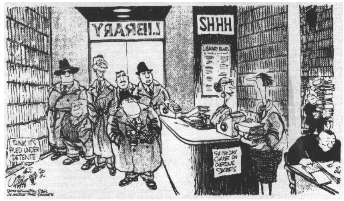
"Miss Clagthorpe, please direct this group of students to 'Weapons, Nuclear (Neutron), Top Secret, Declassified'."