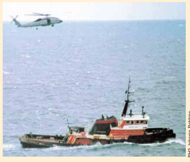
An SH-60 Seahawk from HS-15 aboard George Washington (CVN 73) responds to a distress signal from Coastal Sun, a Norfolk, Va.-based tugboat that was taking on water off the Florida coast on 2 October 1999. George Washington was conducting carrier qualifications in the area.

Note: The number in brackets denotes consecutive years.