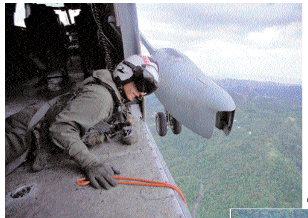
Fleet Composite Squadron 8, NS Roosevelt Roads, P.R., dispatched two UH-3H Sea Kings to help fight a forest fire on 16 March, below. Left, AD2 Tolado Ommanney prepares to release water from the "Bambi Bucket" to douse flames on the ground.