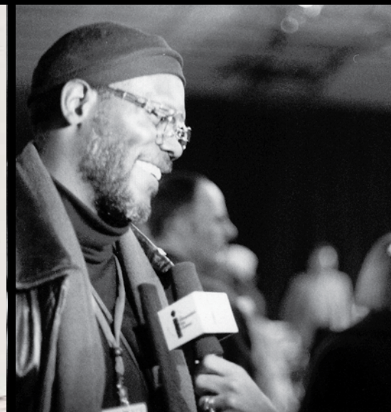
Dramatic Competition Juror Samuel L. Jackson.