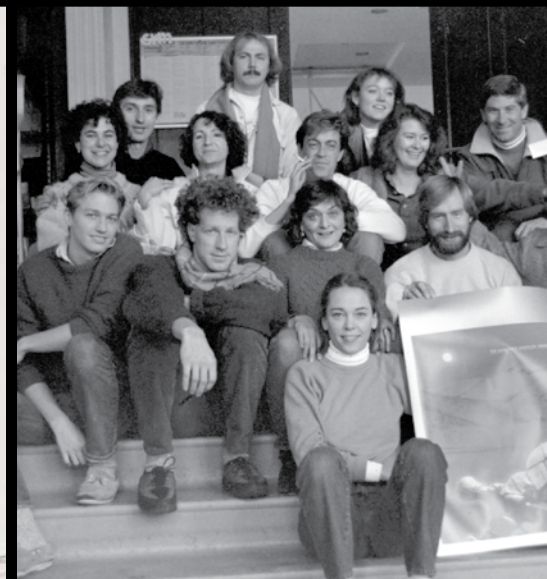
USFF Staff Group Photo.