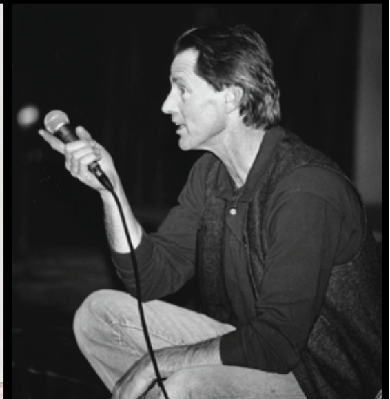
SILENT TONGUE writer/director Sam Shepard.