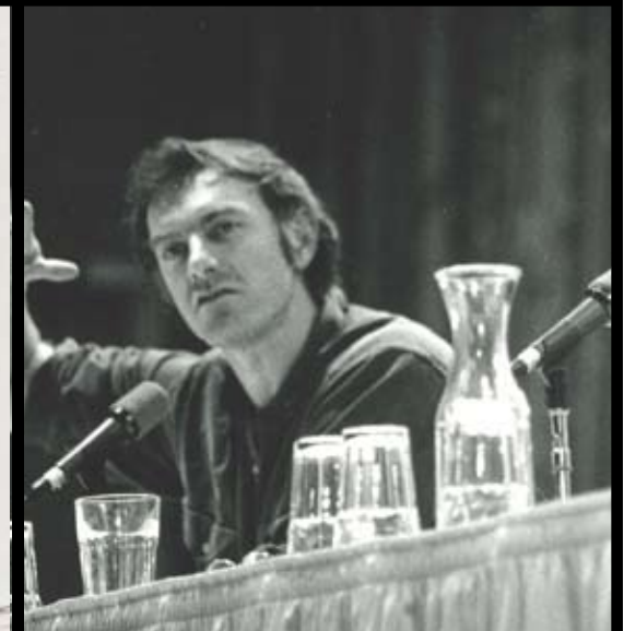
CITY OF HOPE director John Sayles during TANNER 88 discussion.