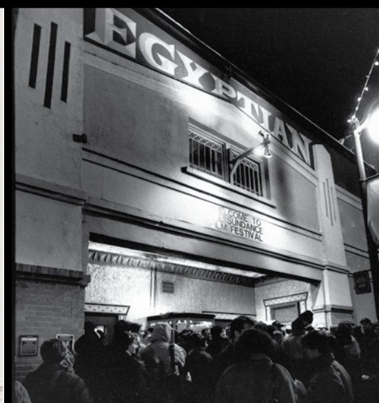
Crowd gathers outside Egyptian Theatre.