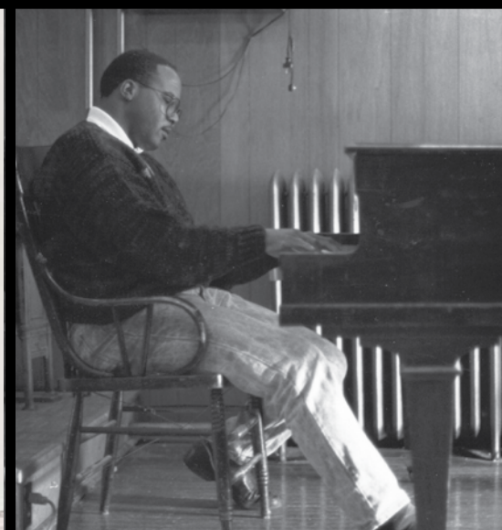
Charles Burnett, director of TO SLEEP WITH ANGER.

Dramatic—TO SLEEP WITH ANGER, directed by Charles Burnett