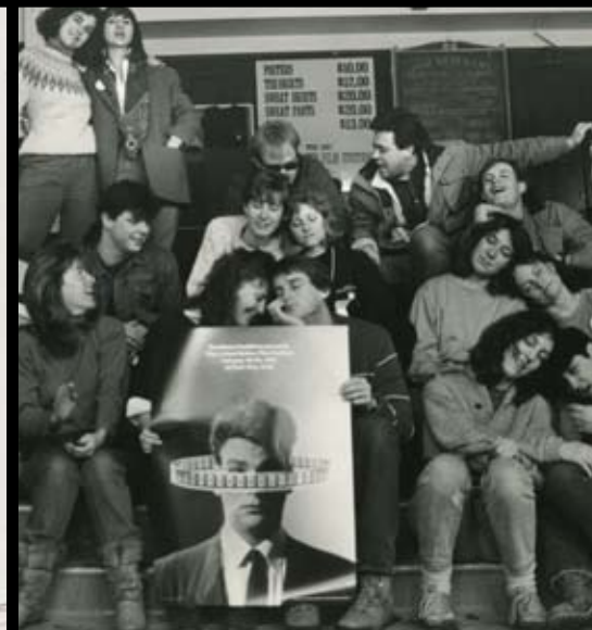
USFF Staff Group Photo.