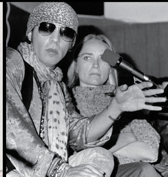
Steve Van Zant participates on Crossover Panel.