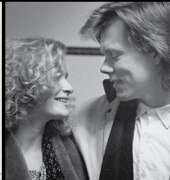
Actor Kyra Sedgwick with THE BIG PICTURE actor Kevin Bacon.