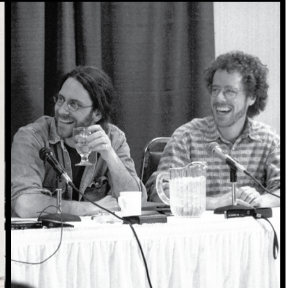
THE HUDSUCKER PROXY directors Joel and Ethan Coen.