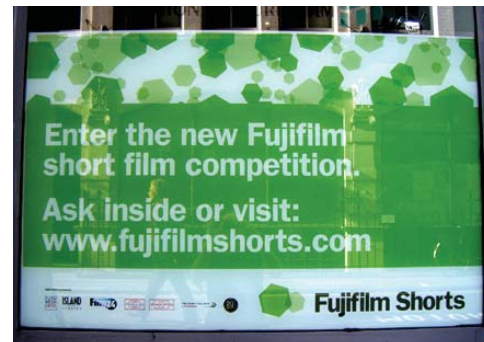
Window advert on display at the FujiFilm offices in Soho, London W1

Panalux are pleased to be sponsoring the Fujifilm Shorts short film competition in which winners can look forward to some amazing prizes.