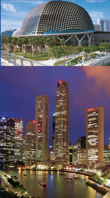
Singapore: The Lion City