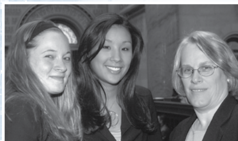
Assemblymember Helene Weinstein (right) with Student Interns

The Assembly’s Session program is the only legislative internship in Albany with a structured academic requirement. No other internship has independent faculty-in-residence teaching its classroom component. It is the only internship that submits to an independent evaluation process conducted by the State Board of Regents’ National Program on Noncollegiate Sponsored Instruction (National PONSI). A copy of the 2007 National PONSI credit recommendation is available upon request to the Assembly Intern Office.