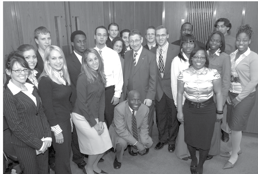
Speaker Sheldon Silver (center) with Student Interns at Issue Forum