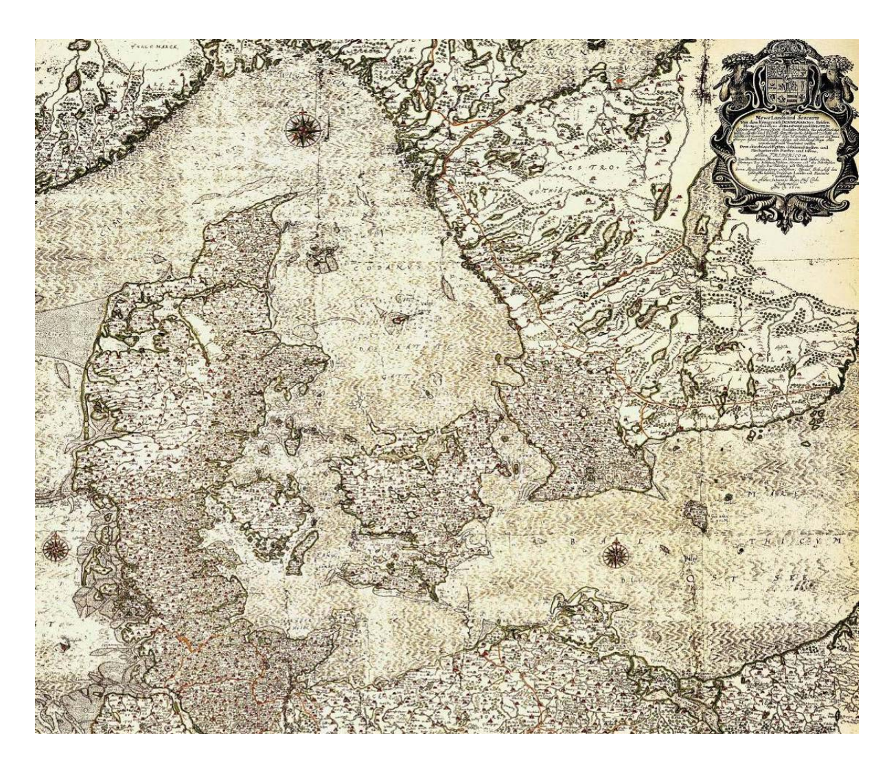
Fig.3:Mejer's 1650 map