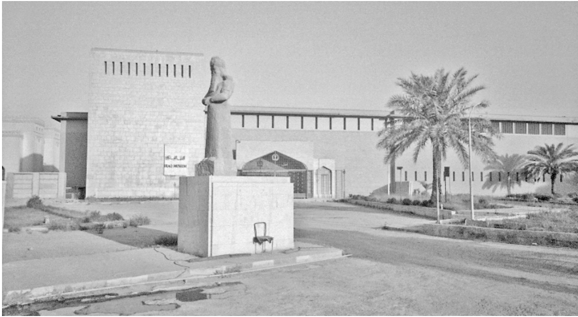
Fig. 1. Iraq Museum, facing the main entrance to the public galleries, taken from the front (southern) entrance to the museum compound, July 2003. (M. Bogdanos)

Baghdad in 1258, to find looting on this scale” 3 and “[t]he pillaging of the Baghdad Museum is a tragedy that has no parallel in world history; it is as if the Uffizi, the Louvre, or all the museums of Washington D.C. had been wiped out in one fell swoop” 4 were among the most extreme. Such sensational-