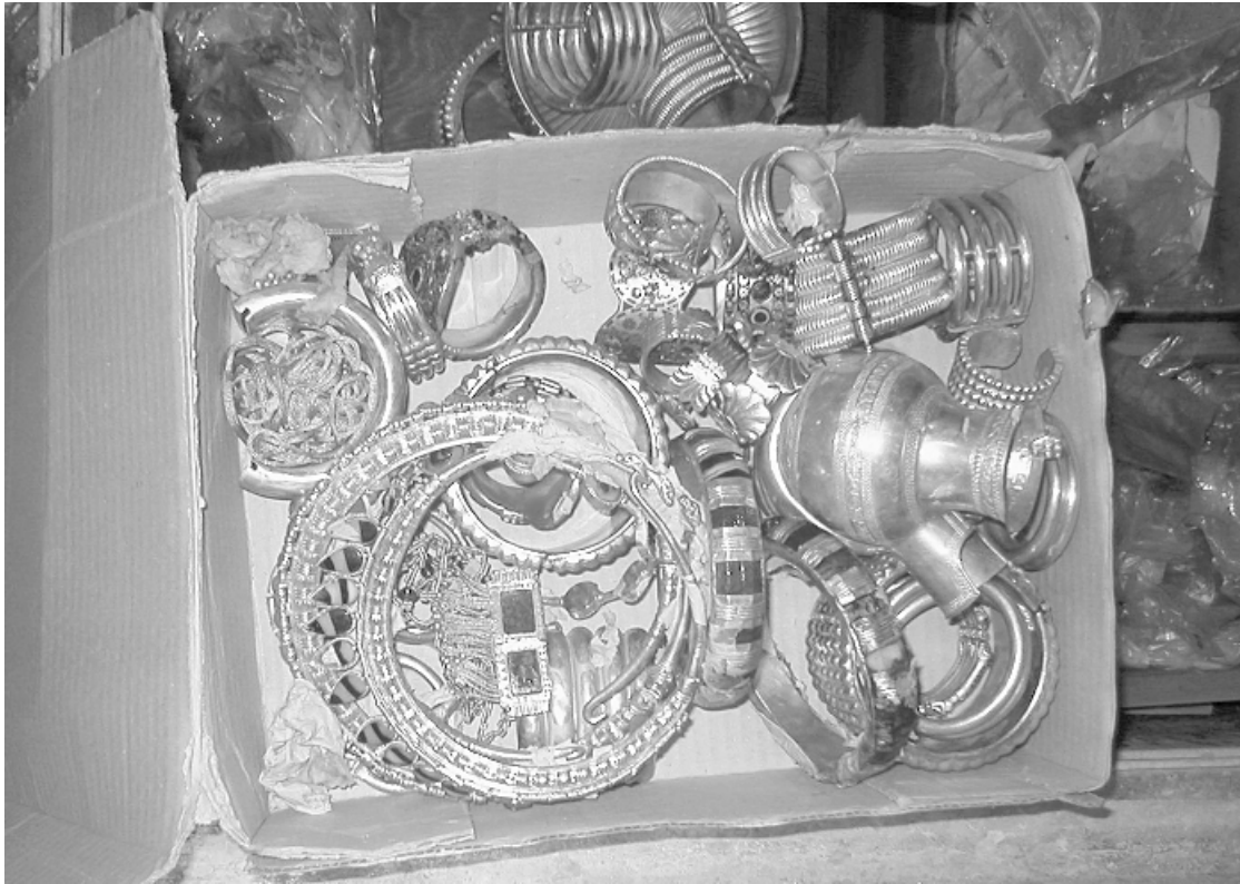
Fig. 12. Treasure of Nimrud. Photograph taken at the moment the box was opened in the underground vault of the Central Bank. June 2003.

In fact, the primary issues discussed during that meeting related to the logistics in moving the treasure, the resources needed to properly prepare the exhibit (Dr. George's main concern), and the security necessary to protect both the treasure from theft and the museum from attack (my main concern). We should not cynically underestimate the sense of dignity and empowerment even such a small step as this one-day opening engendered. Such critics might have been surprised at the joy in the faces of the museum staff as they prepared their museum and the pride they showed on the day their treasure was displayed. 160 The opening proclaimed, if only for a few hours, the possibilities the future held. Today, the Treasure of Nimrud is where it belongs: safe in the hands of the Iraqi people. 161