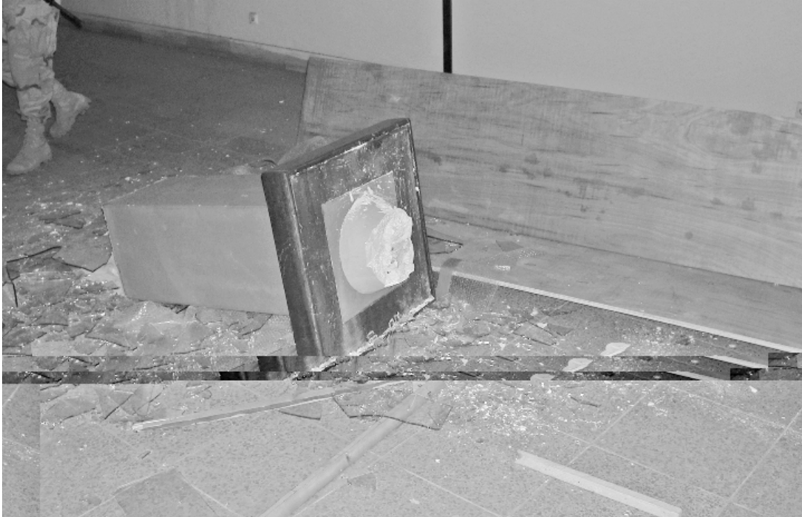
Fig. 2. Base of the Sacred Vase of Warka and its pedestal after the vase was stolen from the museum, April 2003. (M. Bogdanos)