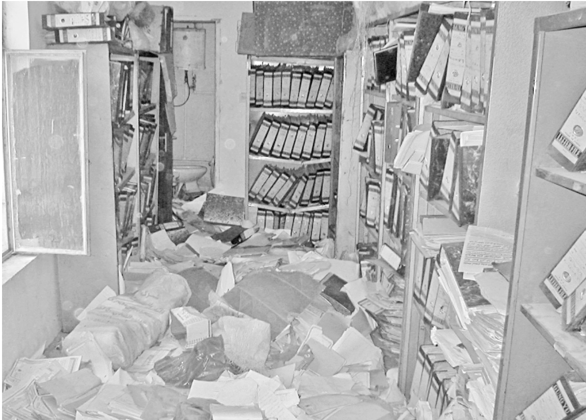
Fig. 9. Destruction in the administrative offices of the museum. April 2003. (M. Bogdanos)

however, 25 pieces or exhibits had been damaged in the galleries and nearby restoration rooms, including 8 clay pots, 4 statues (including a 104-cm-high terracotta lion from Tell Harmal dating from the Old Babylonian period ca. 1800 B.C.), 3 sarcophagi, 3 ivory reliefs, 2 Sumerian rosettes, and what remained of the Golden Harp of Ur. 38