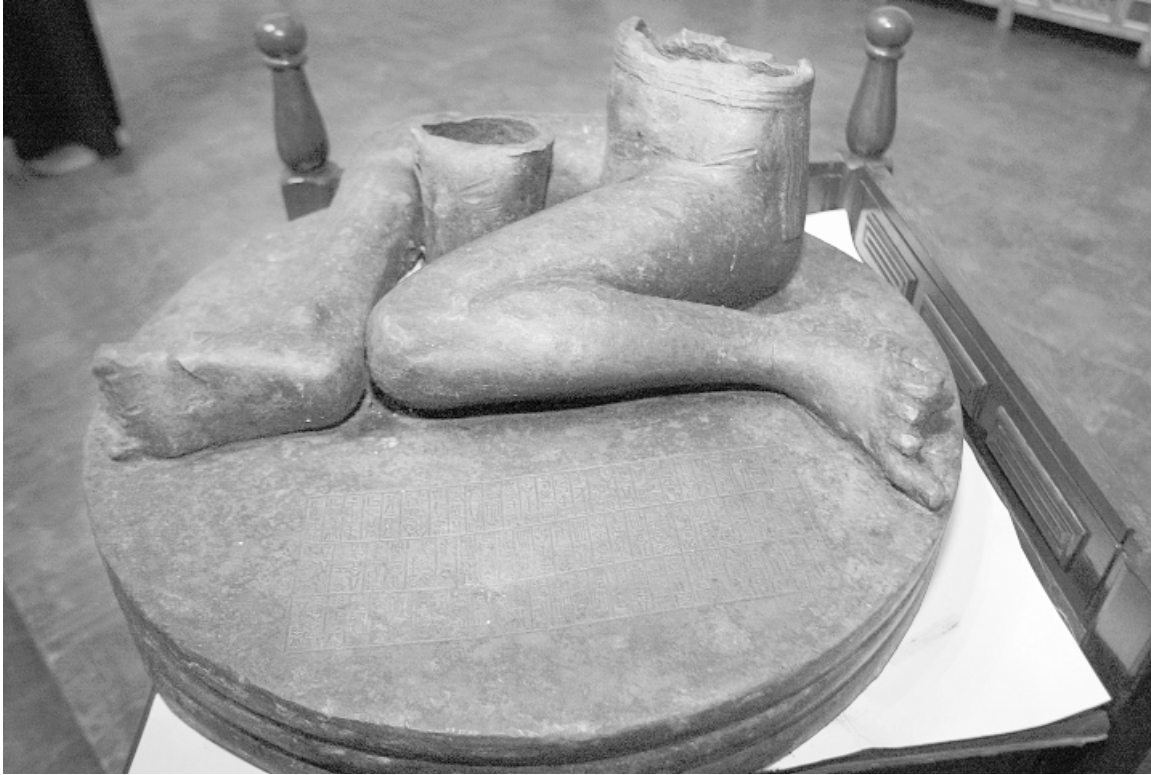
Fig. 5. The Bassetki Statue after it was recovered in November 2003.

ance I ever received was his charge to determine what happened and to recover the antiquities. Given those marching orders and my love of archaeology (and suddenly wishing I had studied a lot harder at Columbia), I chose to lead the team myself, leaving my operations officer in command of the