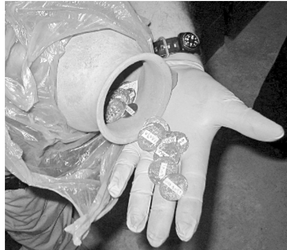
Fig. 11. Some of the gold coins from the collection in the basement that the thieves failed to get. May 2003.