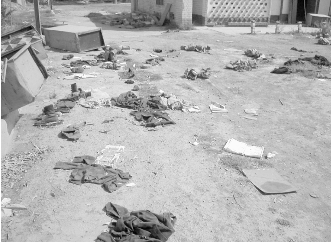
Fig. 7. Iraqi Army uniforms discarded behind museum buildings in the back (northern) part of the museum compound. April 2003

correct; but as investigators trained to deal in facts, we could not afford to resort to such broad-brush skepticism. We knew that good people sometimes do bad things and that moral judgments always get in the way of a good investigation. Another one of our rules, therefore, was that our primary litmus test for any individual—Ba’athist, museum staff member, archaeologist, or average Iraqi—was whether he or she knew anything or had seen or heard anything of value to the investigation.