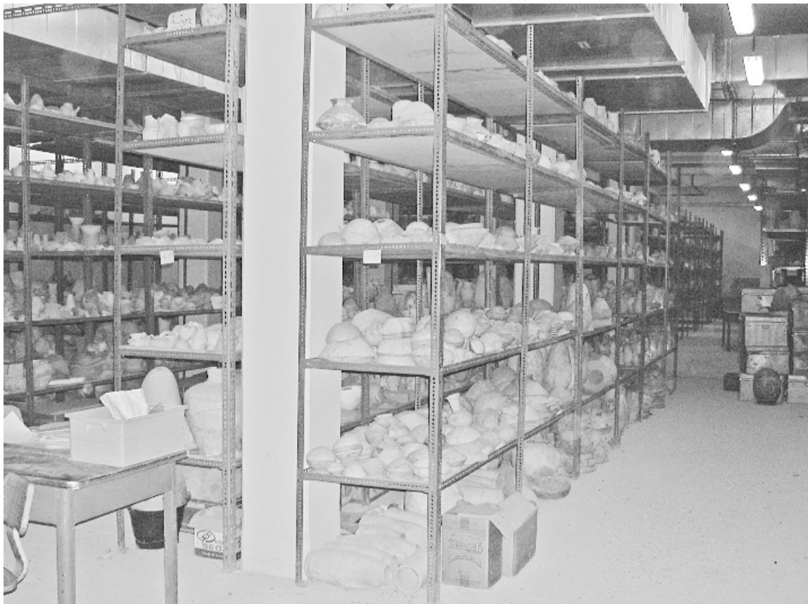
Fig. 10. Basement storage room immediately adjacent to the storage cabinets. May 2003. Note that nothing was disturbed.

sigh of relief—until we reached a single corner in the fourth room, where the chaos was shocking: 103 fishing-tackle-sized plastic boxes, originally containing thousands of cylinder seals, beads, amulets, and pieces of jewelry, were randomly thrown in all directions and what remained of their contents scattered everywhere. Amid the devastation, hundreds of surrounding larger, but empty, boxes had been untouched. It was immediately clear that these thieves knew what they were looking for and where to look.