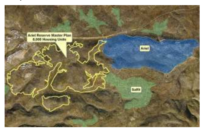
A plan for future construction near Ariel, 8,000 housing units is in "pre-preparation"

Ariel – a plan for another 8,000 housing units for future expansion of the settlement, is in the status of "pre-preparation". If realized, the plan could bring approx. 32,000 new people to the settlement which today has 17,000 settlers.