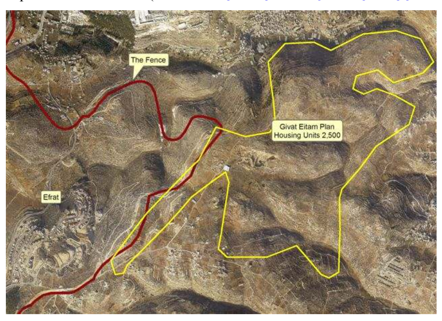
The "Givat Eitam" Plan, for 2,500 HU (in preparation) – beyond the Separation Barrier

The Separation Barrier under construction in the region separates the settlement from the planned area (at times demonstrations are held there by objecting settlers). However, the plans indicate that there is an intention to build there, and from past experience, it seems that as soon as the political conditions will make it possible – construction will start. Recently the military appeal committee has rejected most of the objections filed by Palestinians to the declaration of the area of the plan as "State Land" (see more: <a href="http://www.peacenow.org.il/site/en/peace.asp?pi=66&docid=3555">http://www.peacenow.org.il/site/en/peace.asp?pi=66&docid=3555</a>)