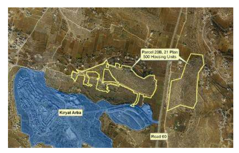
Plan for 500 housing units near Kiryat Arba – in preparation

Givat Hadagan and Givat Hatamar Outposts – the Ministry of Housing is planning the construction of 527 housing units in Givat Hatamar, and another 395 units in Givat Hadagan, both adjacent to the settlement of Efrat.