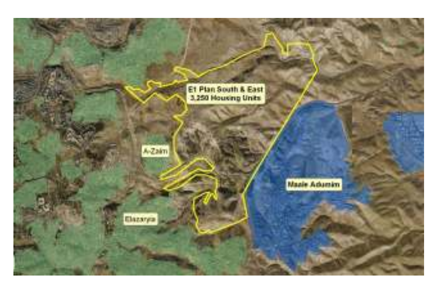
E1 Plan for 3,250 Housing Units – in preparation

See more: http://www.peacenow.org.il/site/en/peace.asp?pi=62&docid=1294&pos=37