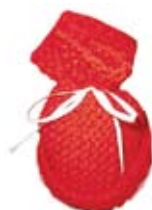
Gathering the top This hat is made from one 5 x 10 inch rectangle.