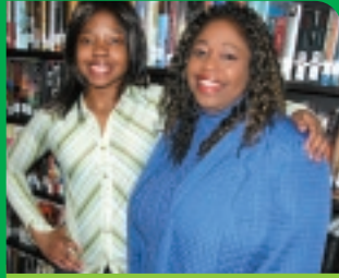
Whitney M. Young, Jr.