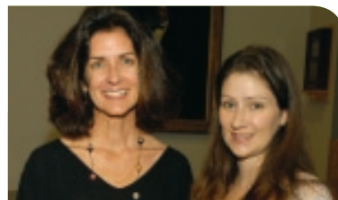
21st Century Award Winners Blue Balliett and Sara Gruen

ABN AMRO/LaSalle Bank Arbor Investments Ariel Capital Management, LLC BlueCross BlueShield of Illinois The Boeing Company Donnelley Charitable Trust First Industrial Realty Trust, Inc. Harris Bank Library Partnership Trust Pritzker Foundation The Regenstein Foundation The Service Club of Chicago Sulzer Family Foundation Virchow, Krause & Co., LLP