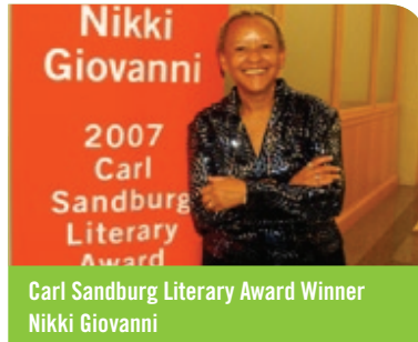
Carl Sandburg Literary Award Winner Nikki Giovanni