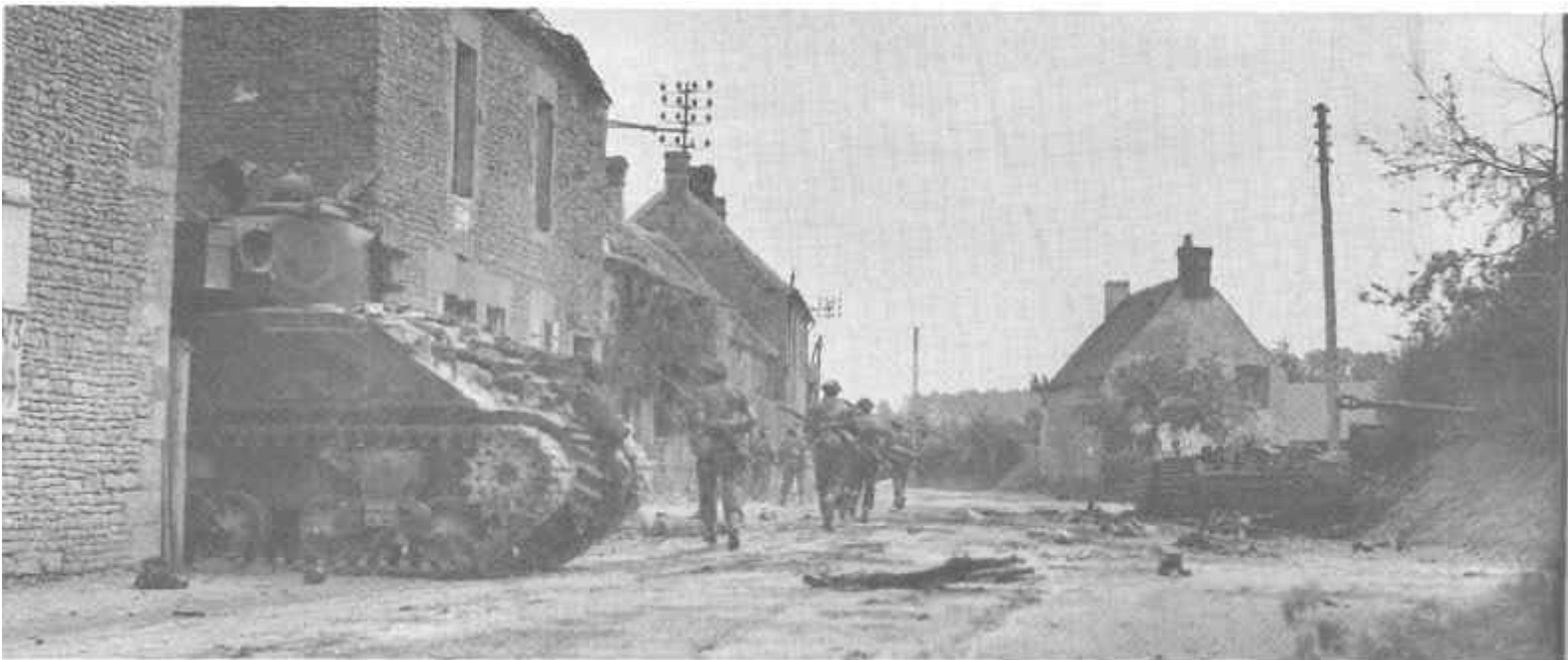
Soldiers from the Argyll and Sutherland Highlanders patrol one of the back streets in St. Lambert-sur-Dives, covered by a Sherman tank from the South Alberta Regiment. Note the knocked out German tank on the right side of the street.