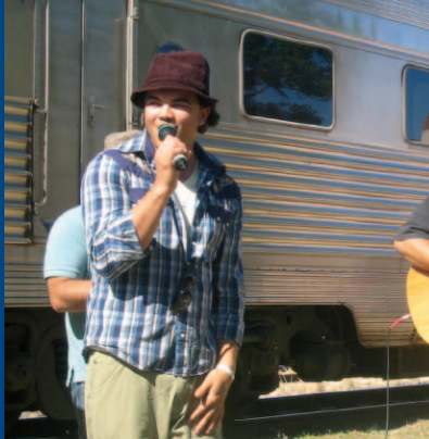
Guy Sebastian entertaining the locals at Rawlinna Station