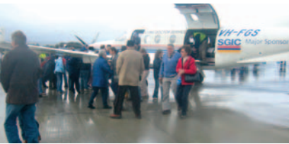
Left: The public lining up to inspect our PC-12... in spite of the weather