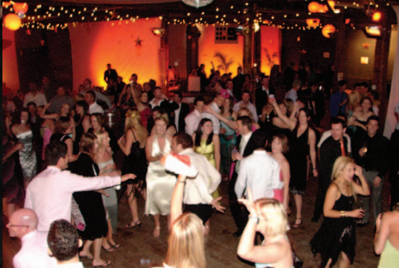
Our guests letting their hair down on the dance floor.