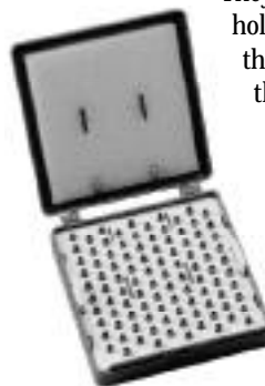
AHG Anschütz Shaker Box

They call it the "shaker box". It is a plastic box that has holes for 100 pellets. To fill it, spill pellets from a tin into the plastic box. You can use any brand of pellets. Shake the box gently until all the holes are filled with pellets. Pour the remaining pellets back in the tin. You can then lock the tray so the pellets are easy to remove while shooting. The nice thing about the shaker box is that it holds enough pellets to get you through a whole match without having to get a new sheet of pellets. It also makes inspecting the pellets easier. Pellets that come from tins should always be inspected by the shooter.