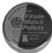
AHG Anschütz H&N Final Match

Anschütz Finale Match is available for rifle (53g) and pistol (50g) in sizes 4.48mm, 4.49mm, 4.50mm and 4.51mm.