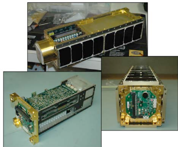
PharmaSat Flight Article